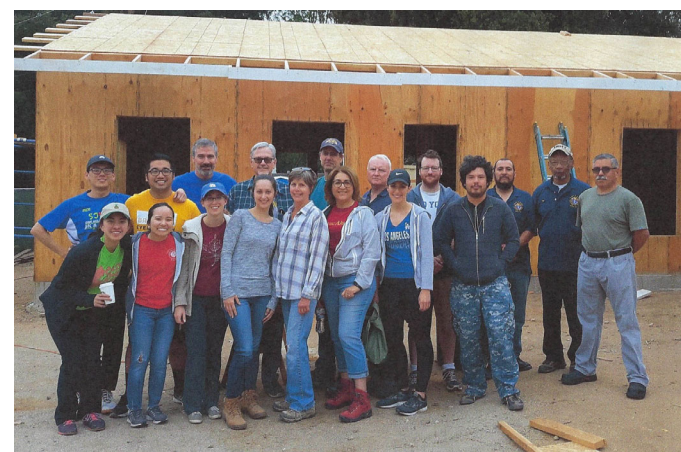
Assumption Parishioners at Habitat build site.