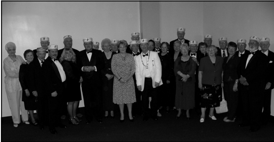
Our new 33° and their guests attending the coronation in St. Louis