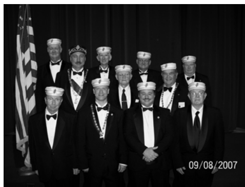
New 33°, Inspectors General Honorary at the coronation ceremony in St. Louis, MO.