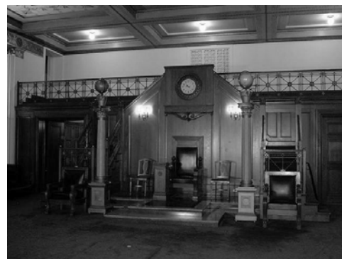
One of the lodge room in the Detroit Masonic lodge building