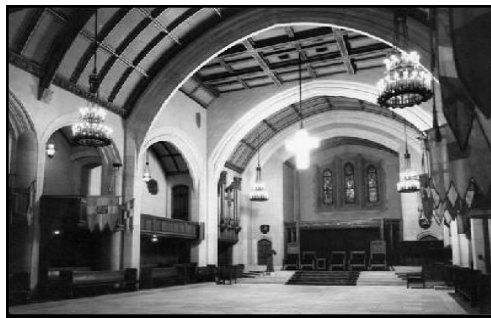
Knights Templar Chapel. Masonic Temple of Detroit