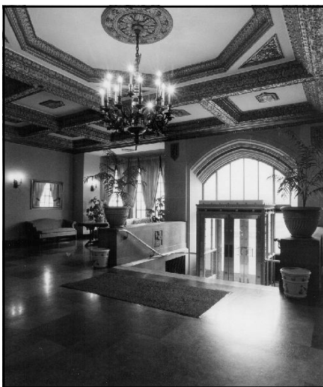
Scottish Rite Lobby, Masonic Temple of Detroit

The Temple is completely self supporting, including a power plant that could power 50,000 houses. The building is perfectly sized, in a ratio of 3:5:7,