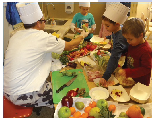
Portage County students work with a chef