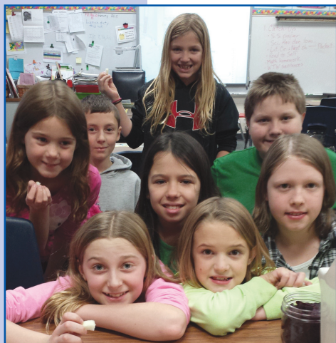
Schools across Wisconsin are engaged in farm to school.

Start to build relationships with nutrition directors and school community members by searching for schools in your area. The Wisconsin Farm to School food service directory lists Wisconsin schools engaged in farm to school activities or interested in purchasing local food. Additionally, you can search for schools in your area at dpi.wi.gov/directories . The USDA Farm to School Census results will provide you with more details about a school district's local food purchasing practices and interest: www.fns.usda.gov/farmtoschool/census# /. The organizations listed in the “Additional resources” section at the end of this toolkit may be able to help you identify and reach out to schools.