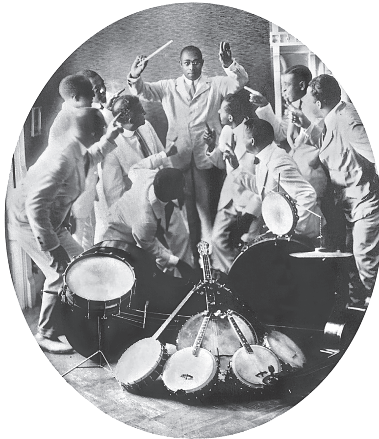
The Clef Club, organized by James Reese Europe, was an African American musicians' union that could supply orchestras of varying sizes on request. In 1914, Europe's own Syncopated Society Orchestra was signed to Victor, becoming the first African American ensemble to secure a recording contract.

American ensemble. They produced eight dance records for Victor that remained profitable for years. After the outbreak of World War I, Europe joined an all-black regiment where he was asked to organize "the best damn brass band in the United States Army." 36 Simultaneously, the Jones Act of 1917 made all Puerto Ricans citizens of the United States. Thus, while his partner Noble Sissle auditioned musicians in Harlem, Europe recruited an additional eighteen darker-skinned Puerto Ricans from the island and formed the 369th Infantry Regiment Hell Fighters Band. After months of trench warfare and reportedly spectacular concerts throughout France, the Hell Fighters returned home to a hero's welcome (including a parade up Fifth Avenue to Harlem), and toured the United States, recording 24 sides of ragtime and jazz for the French Pathé label.