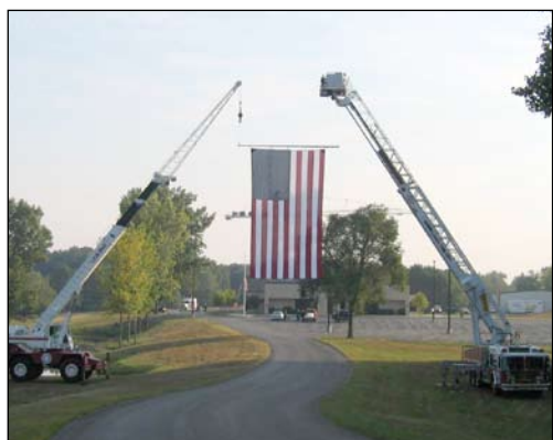
Dedication of MUSAR Homeland Security Training Facility, September 7, 2005, Howell, Michigan