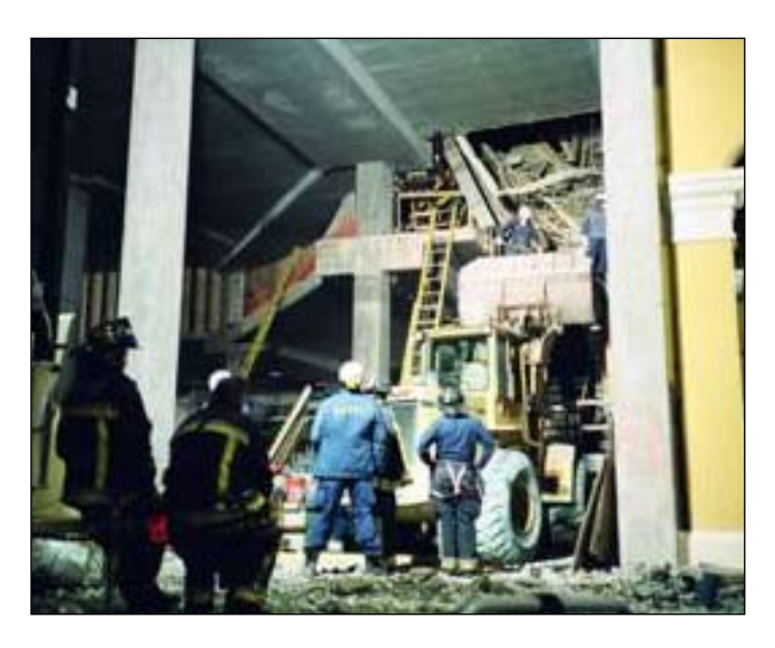
Images of the response by New Jersey Task Force One and IUOE Local 825 to the Tropicana garage collapse in Atlantic City in 2003. Operators, along with their tower cranes and other equipment, were already on site because it was a construction project.