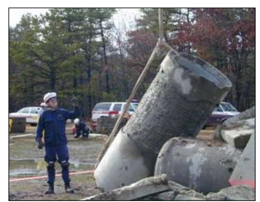
New Jersey Task Force One training with Local 825

These partnerships work. For years, New Jersey's US&R team, New Jersey Task Force One, has been building a relationship with Local 825 that has resulted in the creation of new and innovative techniques for emergency response scenarios. They train together and have been responding to disasters together since the Tropicana Hotel parking garage collapse in 2003. The Michigan Urban Search and Rescue Team (MUSAR) has developed a partnership with Local 324 that has culminated in the creation of the MUSAR Homeland Security Training Facility on the Howell training site owned by Local 324. When L'Ambiance Plaza collapsed in Bridgeport, Connecticut in 1987, killing 28 construction workers, Operating Engineers from Local 478 were onsite and went to work immediately removing rubble. They now have a partnership with Connecticut Task Force One (CT-TF1), the State US&R team. Stationary Locals, like 835 in Philadelphia, Pennsylvania, have provided key information about buildings to responders during fires and chemical releases.