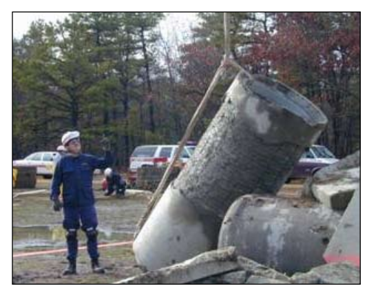
New Jersey Task Force One training with Local 825

For years, Local 825 has been building a relationship with New Jersey's US&R team, New Jersey Task Force One, that has resulted in the creation of new and innovative techniques for emergency response scenarios. They train together and have been responding to disasters together since the Tropicana Hotel parking garage collapse in 2003. Local 324 has been working with the Michigan Urban Search and Rescue Team (MUSAR) since 1999, developing a partnership that has culminated in the creation of the MUSAR Homeland Security Training Facility on the Howell training site owned by Local 324. Operating Engineers were onsite when L'Ambiance Plaza collapsed in Bridgeport, Connecticut in 1987, killing 28 construction workers. They went to work immediately removing rubble. They now have a partnership with Connecticut Task Force One (CT-TF1), the State US&R team. Stationary locals have a critical role, too. Local 835 worked with responders to a gas line fire at Temple University in Philadelphia in 2004. A building engineer who had been trained in hazmat and incident command by the National HAZMAT Program met the responders to explain the systems of threatened buildings and warn of infectious disease hazards in an adjacent research building.