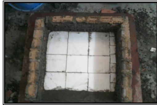
Fig.3.3.3 Wall Cavity filled by wooden Powder

In present study wall thickness of 300 mm was provided in the construction of walls all-round the building and 100 mm for inside walls. Burnt bricks were used (which were immersed in water for 24 hours) to construct insulated wall. The cavity of the wall was filled by the wooden powder and other insulating material.