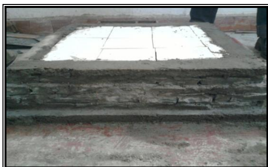
Fig.3. 2 Plinth

A plinth of height 0.2 m above ground level was adopted, constructed with 1:6 cement mortar. The plinth slab of (100-150) mm which is conventionally provided, was avoided and in its place, in order to take necessary precaution, impervious blanket like concrete slabs or stone slabs was provided all round the building to reduce erosion of soil and thereby avoiding exposure of foundation surface and crack formation.