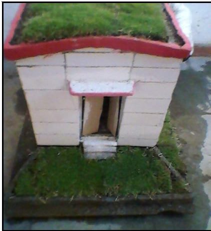
Fig.3.6.2 Green Roof

Normally 12.5 cm thick RCC slabs are used for roofing of residential buildings the roof may be flat or inclined. But a green roof can be defined as a roof of the building, which is partially or completely covered with vegetation and a growing medium, planted over a waterproofing membrane. It may also include additional layers such as root barriers, drainage and irrigation systems.