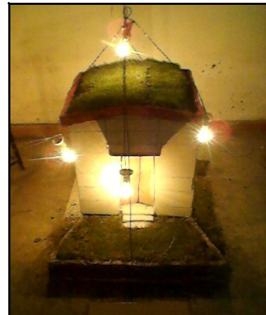
Fig.4. 1 Temperature Testing on Green Building

Therefore the result shown above indicate that a Green building will have reduced room temperature and provide more cooling effect as compared to the traditional building.