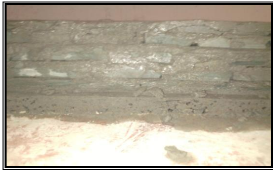
Fig.3. 1 Foundation

safety of the structure being the priority consideration, it is recommended to adopt a foundation depth of 0.6 m for normal soil like gravely soil, red soils etc., and use the un-coursed rubble masonry with the bond stones and good packing. Similarly the foundation width is rationalized to 0.6m. To avoid crack formation in foundation the masonry shall be thoroughly packed with cement mortar of 1:8 boulders and bond stones at regular intervals.