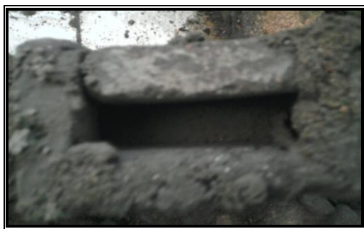
Fig.3. 3.2 Cavity in Wall

Houses built before the 1930's had solid walls, but for those walls having cavities, filling the gap with new insulation techniques will always help in not only saving money on fuel bills, but also the temperature of our home will be under control irrespective of the external climatic changes. Mostly fiberglass, cellulose insulation, and polyurethane or polystyrene foam are the materials used to fill wall cavity gaps but here in this project, blow-in and foam fill insulation technique was used nuzzled between the two levels of wall which also helped in keeping the moisture at bay. A hole is located or drilled between the walls and the insulation is pumped or blown in through mechanical means. The process is clean and very quick, and installation also was very easy. The space which was previously filled with air was now occupied, immobilizing airflow and preventing convective heat transfer. This draft reduction from reduced air movement will thus help in keeping homes warmer in the winter, and the insulation thus helped keeping cooler air inside during the summer. Additionally, CO 2 emissions are also drastically reduced, providing for a green solution to the world's global warming. This thus proved to be one of the most simple and cost-effective techniques for making our home more energy-efficient, saving about (10 % to 40%) of the cost due to home energy heating and air-conditioning bills.