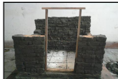
Fig.3. 4 Door Frame Fitting

It is suggested to use wooden doors and windows in place of concrete or steel section frames as was done for this project thus achieving good thermal insulation, cause wooden doors and windows have less effect of temperature variations or sun light as compared to the concrete and steel doors and windows and the location of these doors and windows were mostly in northern or southern direction so as not to face the sunlight directly, in the mean time providing sufficient ventilation and air circulation for giving cooling effect.