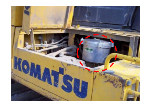
Luboil By-pass fitment on Mining equipment