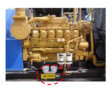
Luboil By-pass fitment on Oil Field equipment