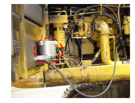
Luboil By-pass fitment on Earth moving equipment