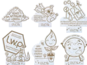
SET OF 7 KINDS SMALL CHARACTER STRUT CARDS