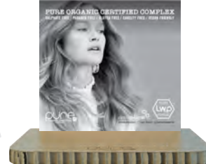
COUNTER STAND WITH BACKING CARD