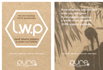
LWP AND ORGANIC SHELF TALKERS