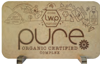
RETAIL STAND HEADER

SPEND $295 ON ASSORTED PURE STOCK – INCLUDING PACKS AND RECEIVE 1 OF EACH MERCH ITEM NO CHARGE