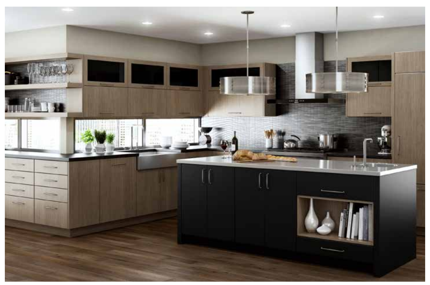
Bria Cabinetry shown with "Moda" door style in Quarter Sawn Red Oak with Cashew finish. Island shown with "Chroma" door style in Black paint. Black back-painted glass in frame doors.