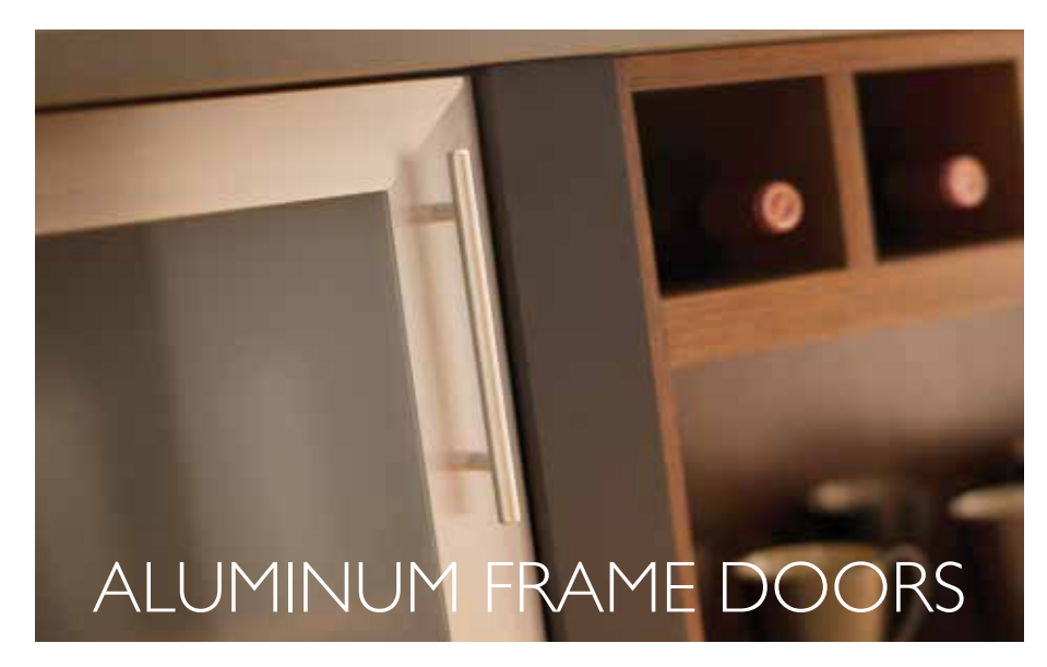
FEATURED ON COVER