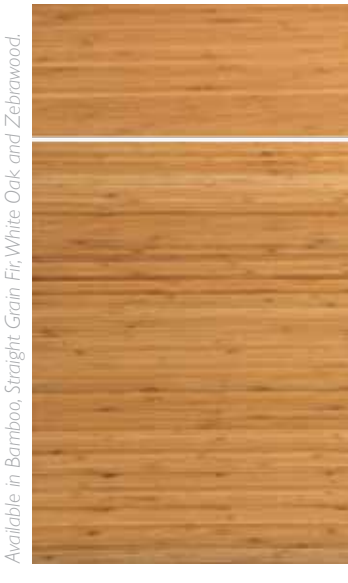
METRO - HORIZONTAL BAMBOO - NATURAL