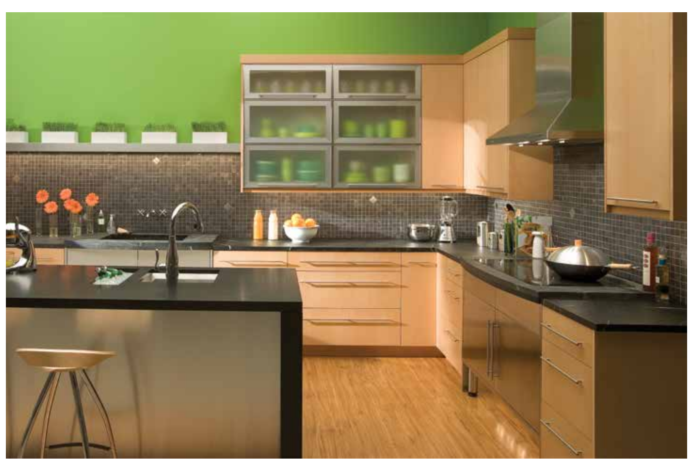
Alectra Cabinetry shown with "Metro" door style in Vertical Grain Fir with Natural finish. Stainless steel and Aluminum Frame doors also shown.