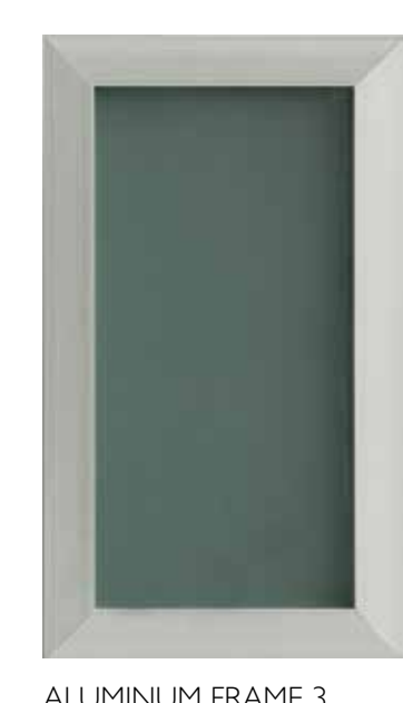
ALUMINUM FRAME 3