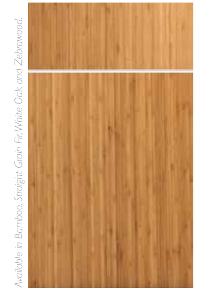
METRO - VERTICAL BAMBOO - NATURAL