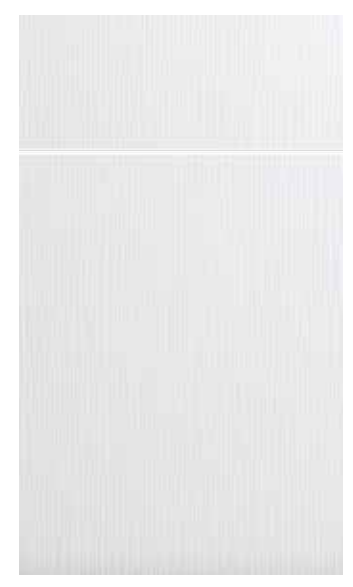
URBANA - VERTICAL SEA SALT