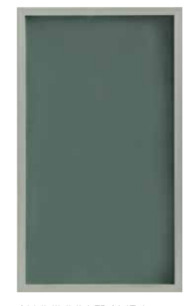
ALUMINUM FRAME I

Aluminum Frame doors are a popular way to incorporate glass doors within a contemporary kitchen. Available with clear glass, obscure (frosted) glass or patterned glass, Aluminum Frame doors are an ideal choice for contemporary designs that favor sleek, clean lines. See your Dura Supreme kitchen designer for frame and glass selections.