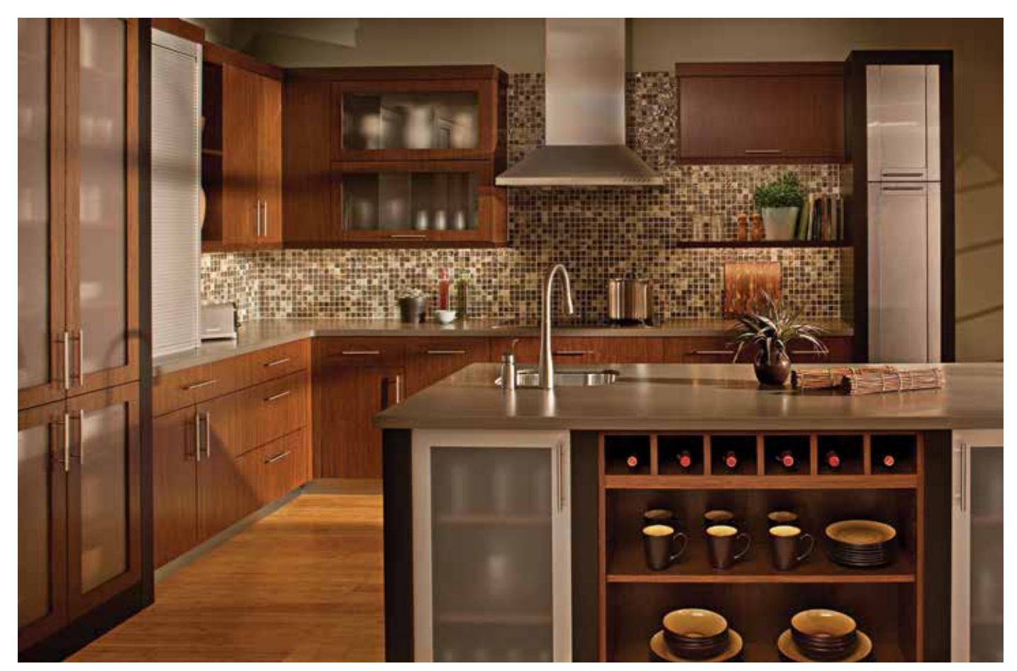
Alectra Cabinetry shown with "Moda" door style in Quarter Sawn Red Oak with Mission finish. Aluminum Frame and Stainless Steel doors also shown.