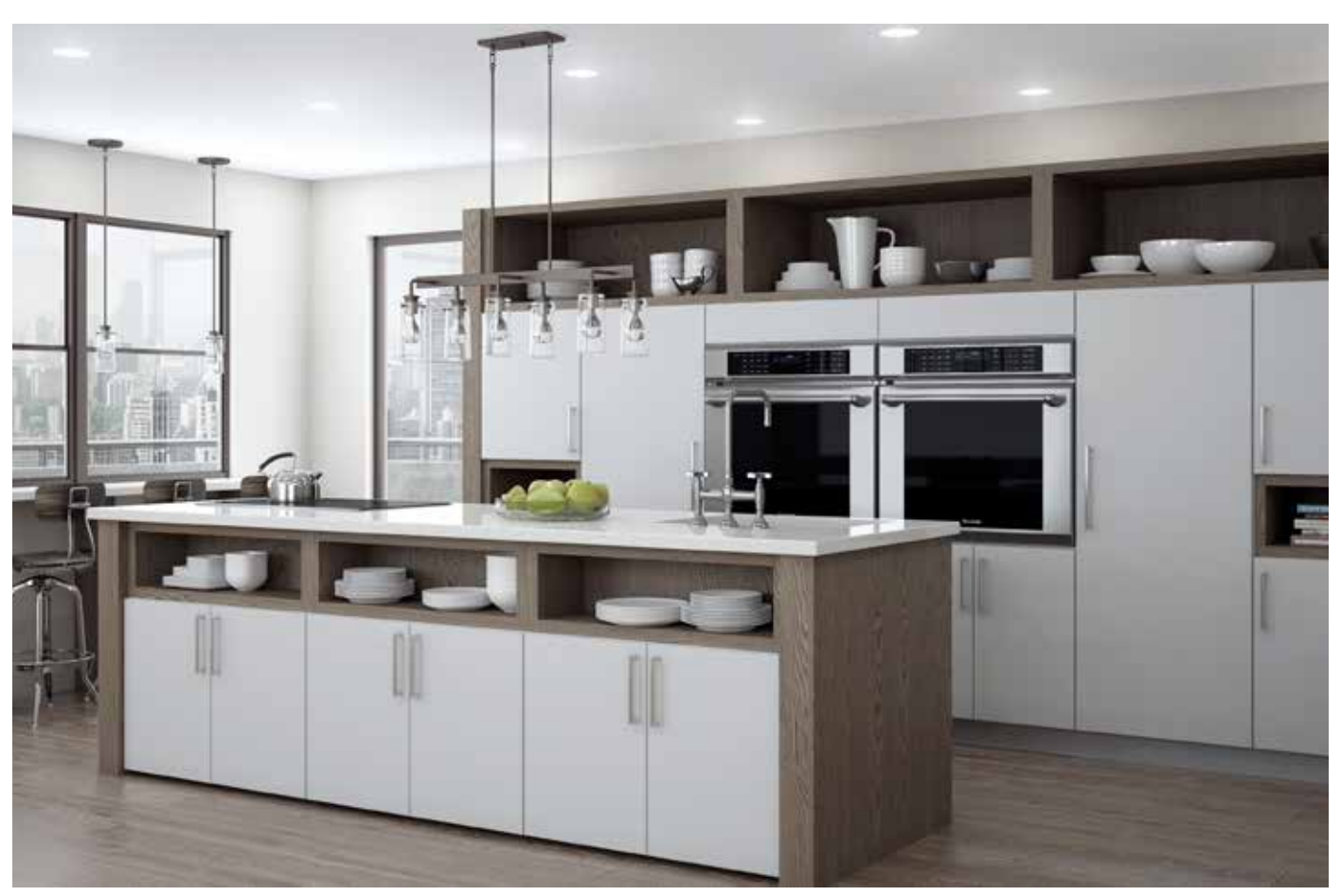
Alectra Cabinetry shown with "Chroma" door style in Pearl paint, and Weathered Oak "A" accents and shelving.