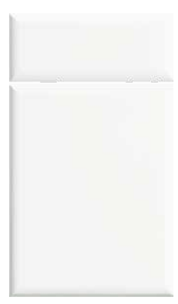
SOHO - HORIZONTAL*