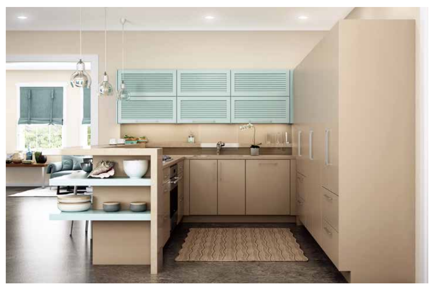
Bria Cabinetry shown with "Chroma" door style with Personal Paint Match (#7535 Sandy Ridge) and Louvered door style with Paint Match (#6478 Watery).