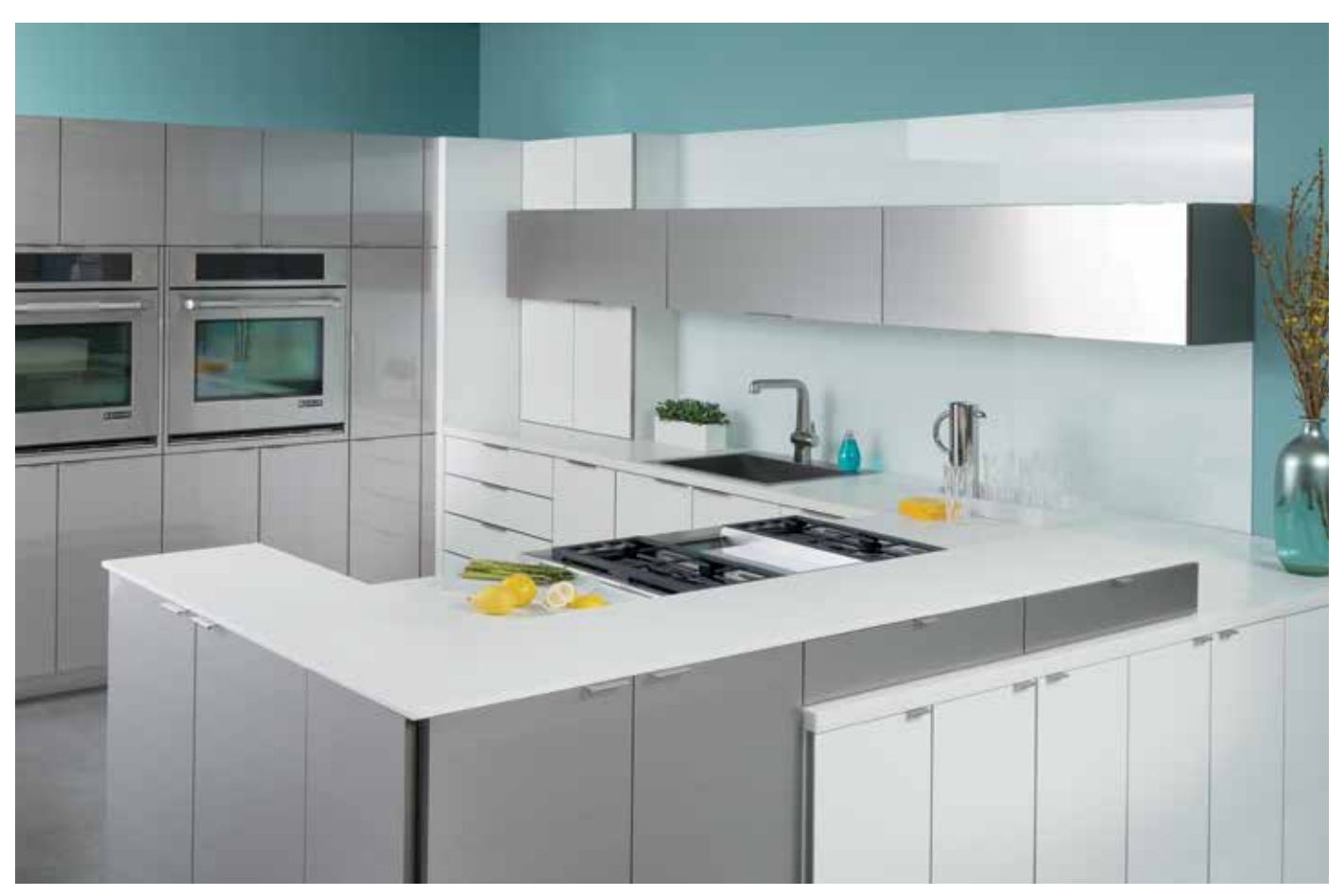
Alectra Cabinetry shown with "Ava-2T" door style in White Acrylic and "Talia-Horizontal" door style in Wired Mercury.