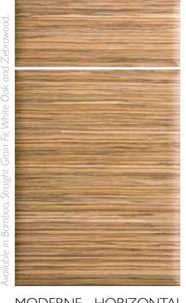
MODERNE - HORIZONTAL ZEBRAWOOD - NATURAL