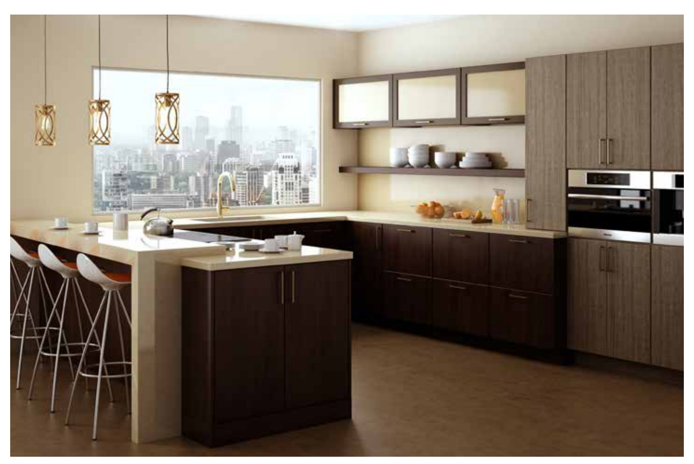
Bria Cabinetry shown with "Moda" door style in Maple with Poppyseed finish. Tall cabinetry shown with "Urbana" door style with Dune (Textured Foil). Bronze Aluminum Frame doors also shown.