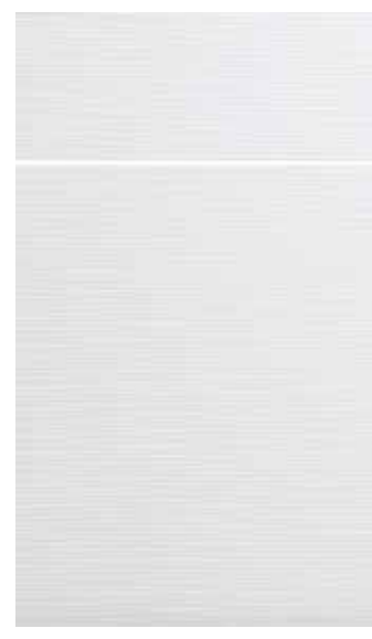
URBANA - HORIZONTAL*