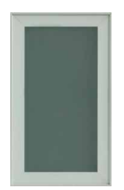
ALUMINUM FRAME 2