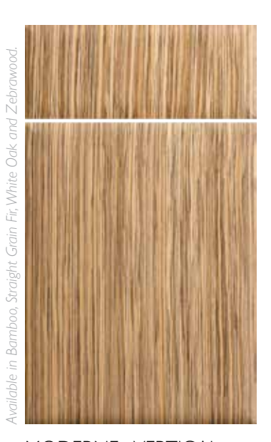
MODERNE - VERTICAL ZEBRAWOOD - NATURAL