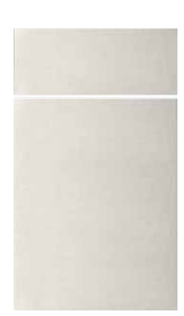
STAINLESS STEEL SLAB