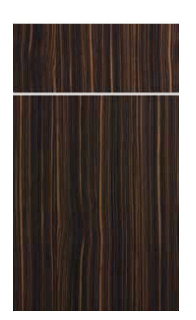
SOHO - VERTICAL MACCHIATO