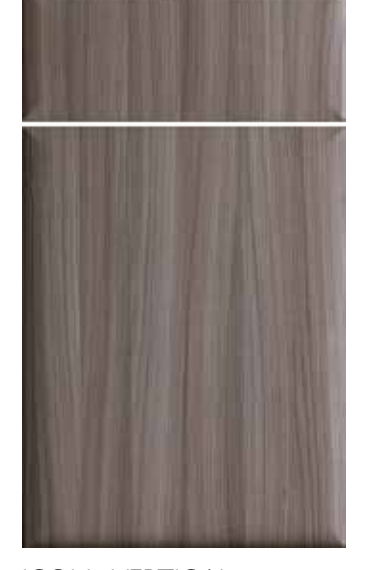
ICON - VERTICAL TWIG