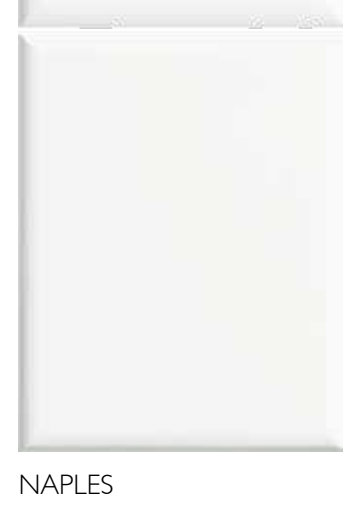
IMPORTANT: Accuracy of color is subject to printing limitations and will not match actual product. Final color selections should always be made from a door sample and/or display.