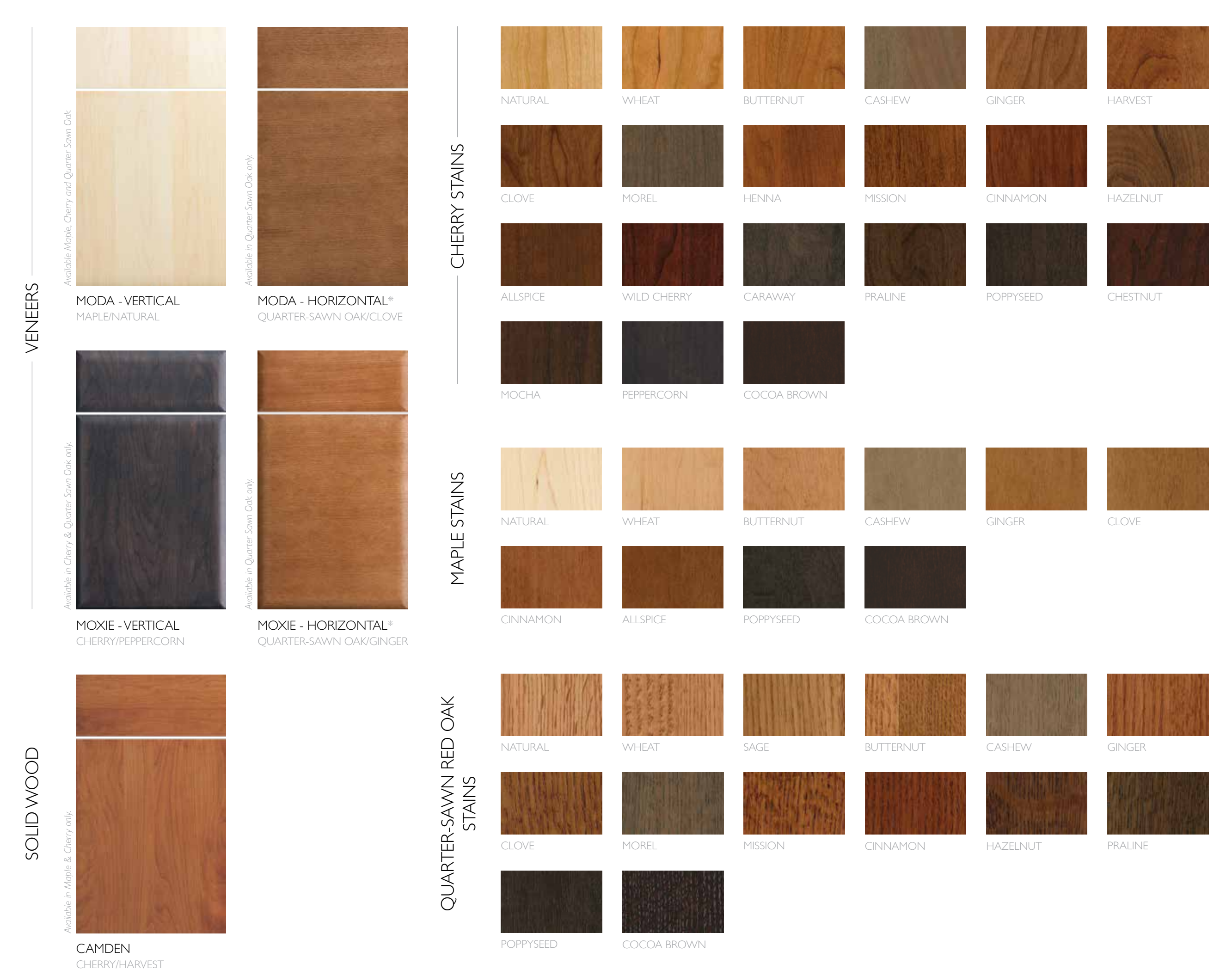
*Horizontal grain available for Alectra only.