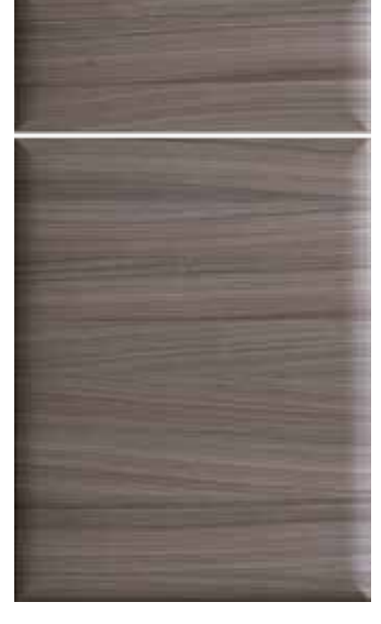
ICON - HORIZONTAL* TWIG