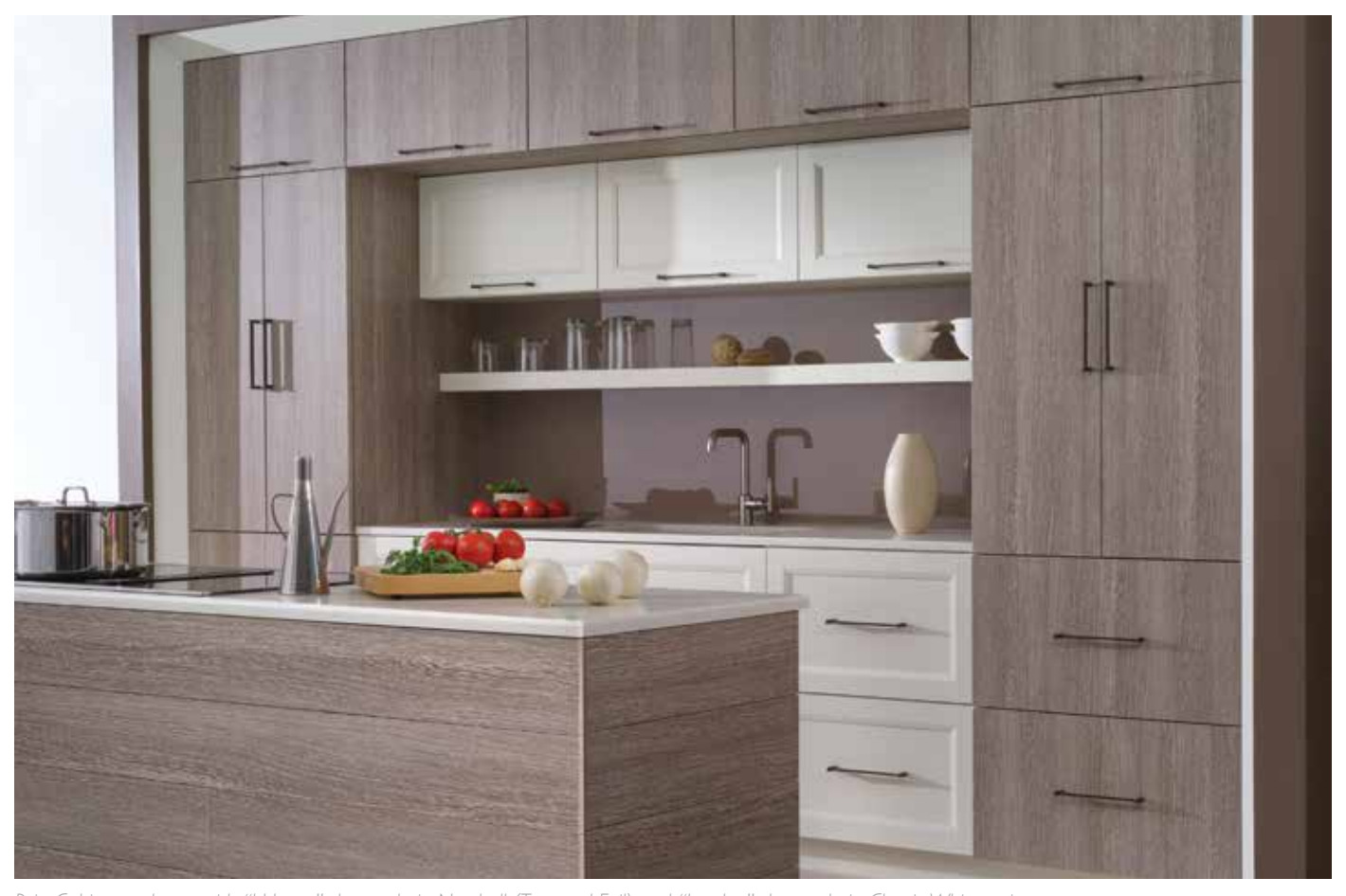
Bria Cabinetry shown with "Urbana" door style in Nutshell (Textured Foil) and "Lynden" door style in Classic White paint.