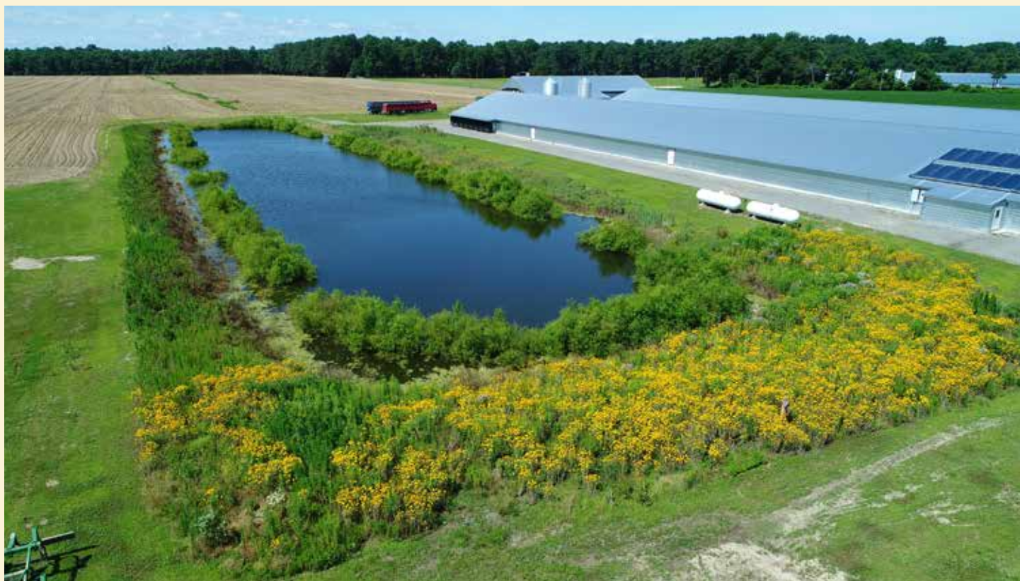
A mixed vegetation buffer near a poultry house at Hill Farms in Houston, Del., offers habitat for pollinators and natural enemies, and reduces dust coming off of the poultry house.

Visit www.sare.org/pests for more information on ecological pest management.