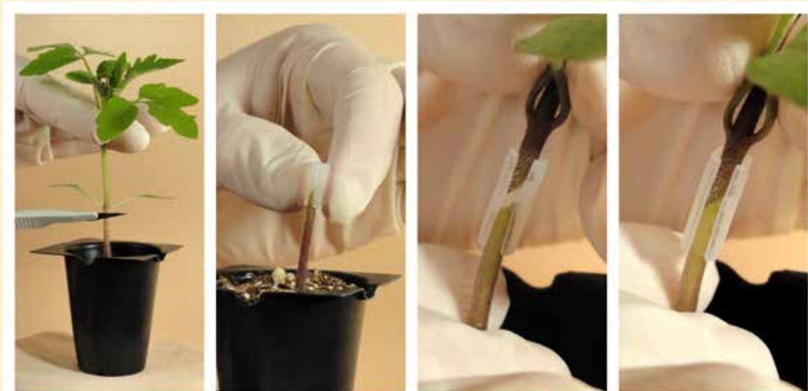
Details of the process for grafting tomatoes.

Wildflower habitat on a Georgia apple farm designed to attract beneficials and native pollinators.