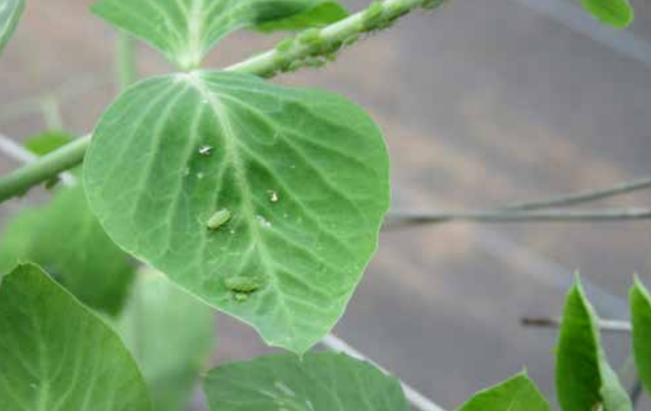
Aphids on sugar snap peas.

field edges protects water quality and supports wildlife while also providing habitat for important beneficial organisms. Along with allowing beneficial soil organisms to thrive, conservation tillage leads to lower fuel and labor costs. Practices that result in more careful use of inputs, such as scouting, monitoring, IPM and variable rate applications, not only create a more favorable growing