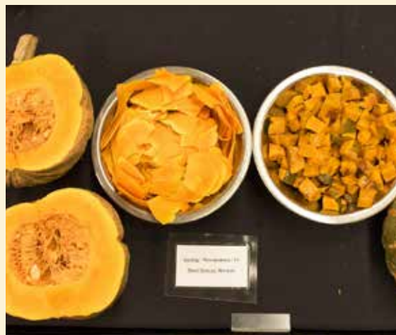
In Oregon, farmers and Extension specialists worked together to expand the local market for winter squash. They identified varieties that would produce well using integrated disease management strategies, would keep in storage, and were marketable to chefs and consumers.

Seeking new ways to help farmers manage soil-borne diseases and increase their winter sales, Oregon State University researchers used two SARE grants to explore the potential of different winter squash varieties (SW15-021 and OW16-008). They looked at everything from disease management to storage and marketability. In one project, the team shared integrated disease management strategies with Willamette Valley farmers, including fungal disease symptoms and scouting, crop rotation, fungicide treatments and the use of disease-resistant varieties. In the other project, they used on-farm trials to assess the profitability of different squash