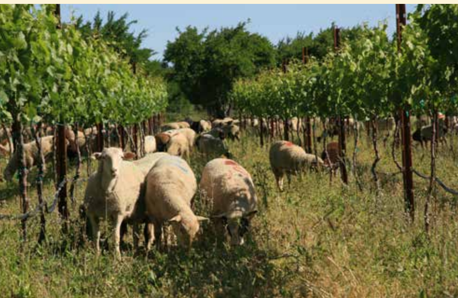
These sheep at a vineyard in Winters, Calif., were trained to ignore grape leaves while grazing on vegetation such as weeds and cover crops.