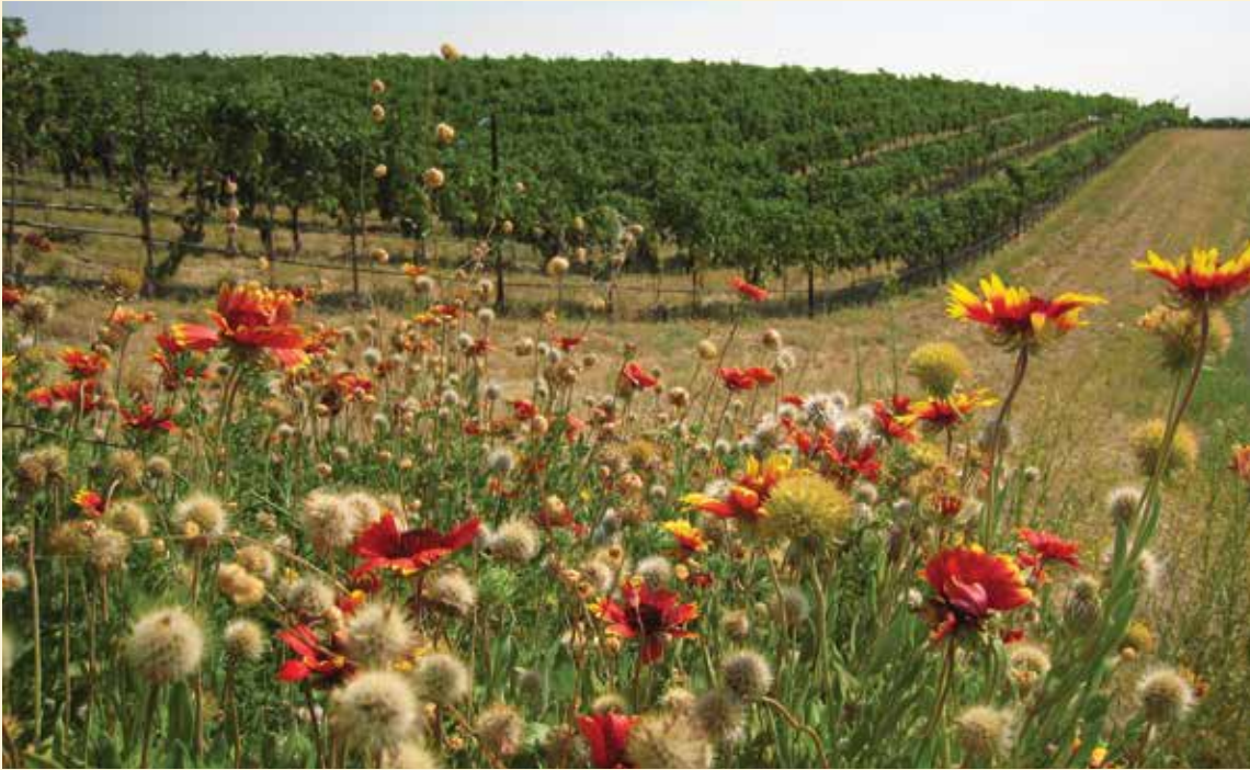
Ten vineyards partnered with Washington State University to improve or restore wildflower habitat near their fields. The result was fewer pesticide sprays and more beautiful scenery for visitors.