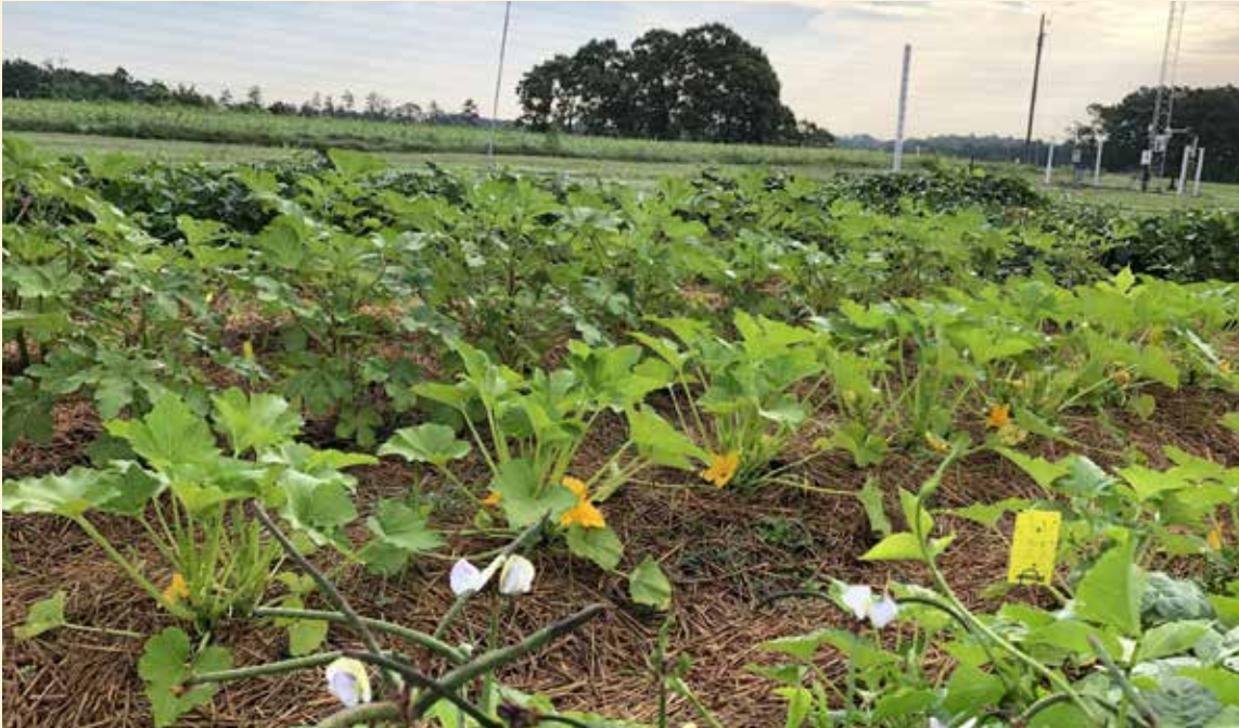
Cowpeas are intercropped with squash to attract pollinators and beneficial insects, and to add nitrogen to the soil. Straw mulch adds organic matter, shades out weeds, improves water retention and minimizes disease transmission from the soil to plant leaves.