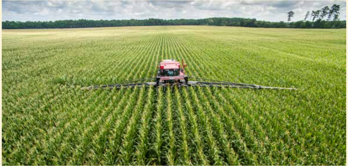
Seeding a cover crop into corn in a no-till system. This is an example of how more farmers are taking advantage of holistic, ecological principles to manage pests, nutrients and water with fewer purchased inputs.

Ecological strategies mimic and reinforce the natural relationships already built into farming systems.