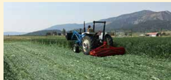
Examples of ecological pest management practices include (clockwise from left): crop scouting, rotating crops and the use of no-till and cover crops.

SUCCESSFULLY MANAGING PESTS IS ONE OF THE BIGGEST challenges for farmers and ranchers who want to run their operations sustainably. In order to reduce their use of off-farm chemical inputs, they need management options that are reliable and profitable. More and more, farmers across the United States are realizing that ecological pest management strategies can provide what they're looking for. For example, practices that promote natural enemies of pests on the farm provide an estimated $4.5 billion worth of pest suppression each year nationwide. Other common practices include rotating in new crops that disrupt pest cycles, enhancing a crop's ability to compete against weeds and building soils that naturally suppress disease microorganisms. The ecological approach uses knowledge, biodiversity and resource management to produce healthy crops and keep pest insects, weeds and diseases at bay.