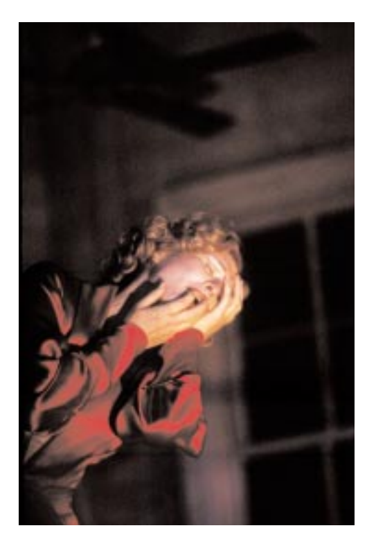
Glenn Close

Nothing had prepared the audience for the searing and complex adult themes of the play. One critic called it the product of an "almost desperately morbid turn of mind". In contrast, another described it as "a revelation. A lyrical work of genuine originality and disturbing power". Such were and continue to be the extreme reactions to the play.