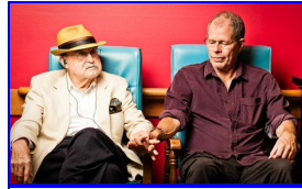
Aging Back in the Closet: