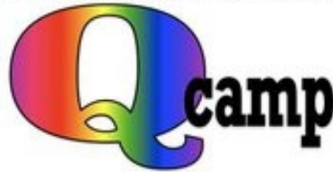
Summer camp for LGBTQ & Ally Contra Costa youth ages 14 – 18