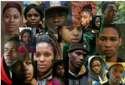
El Cerrito High School: Da Rainbow Clique Call: 510-524-8252