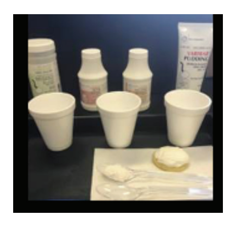
FIGURE 2. Sample of a standardized, clean, efficien tray set up.

tuted with water), which contains rice starch and has been shown to be equivalent to IDDSI Level 1 (Slightly Thick).<sup>38</sup> If IDDSI Level 1 (Slightly Thick) is not sufficient to achieve safe and efficient oral intake, and thicker IDDSI Levels (Mildly Thick IDDSI Level 2 or Moderately Thick IDDSI Level 3) are shown to significantly improve oropharyngeal swallowing function, the clinician must use clinical testing methods, such as the IDDSI Flow Test, to determine the appropriate thickener-to-formula ratio to match the IDDSI Level that was determined to be safest under MBSS. Note that when mixing formula with commercially available thickening agents, a number of factors have been shown to influence the resulting thickness, including: the type of thickening agent used, the base fluid (formula) characteristics, the amount of base fluid, the temperature of the formula at mixing and at serving, the sit time (time from preparation to consumption), and the method of mixing the thickening agent into the fluid (i.e., shaking, stirring, and/ or immersion blending). 22,37