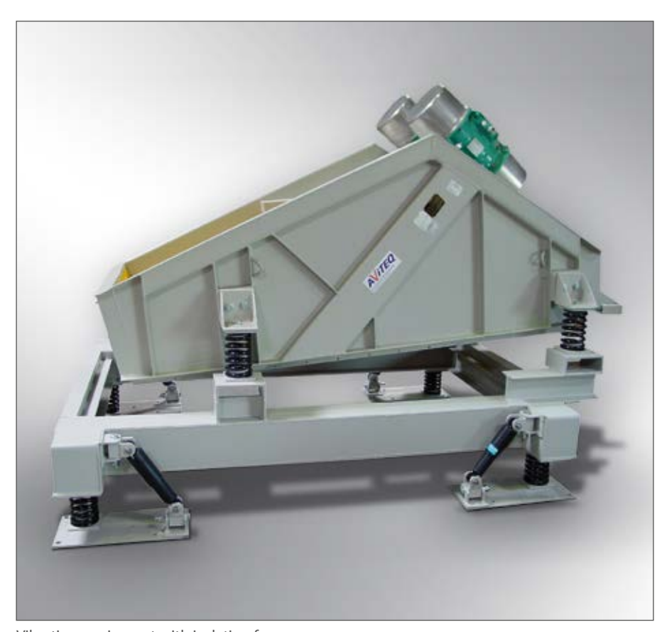
Vibrating equipment with isolating frame

That is why AViTEQ vibrating equipment can be equipped with various different support or suspension elements. Each of them has particular characteristics and benefits.