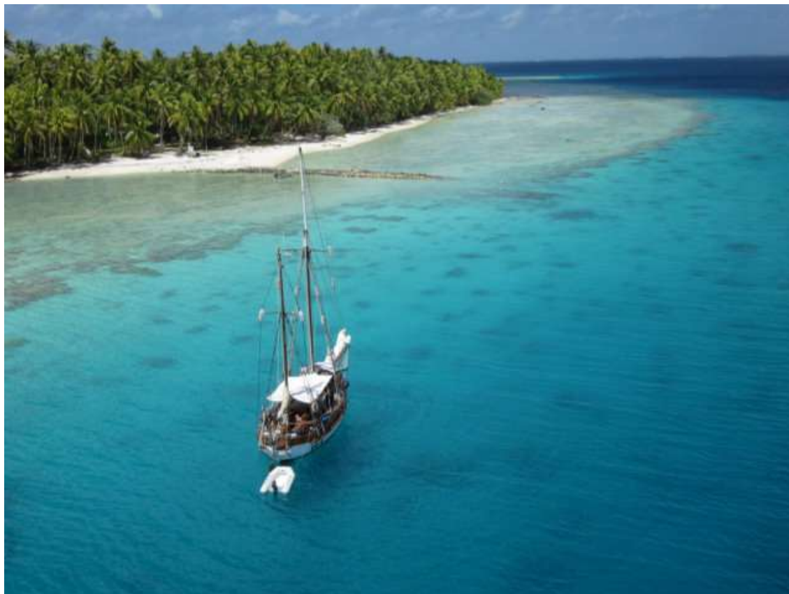
The anchorage at Suwarrow, in the Cook Islands--off Tom Neale's dock

A Compilation of Guidebook References and Cruising Reports