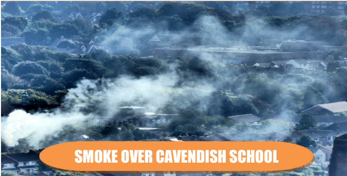
SMOKE OVER CAVENDISH SCHOOL

"Strange isn't it. The biggest threat to our safety is now the very air we breathe. With modern technology we can measure air quality. The results are distressing. Eastbourne, our beautiful seaside town, is statistically one of the most polluted in the country. How is that possible? And why is nothing being done!