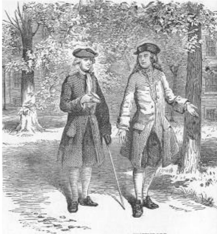
John Wesley with the leader of the Moravians, Count Nicholas Ludwig Von Zinzendorf