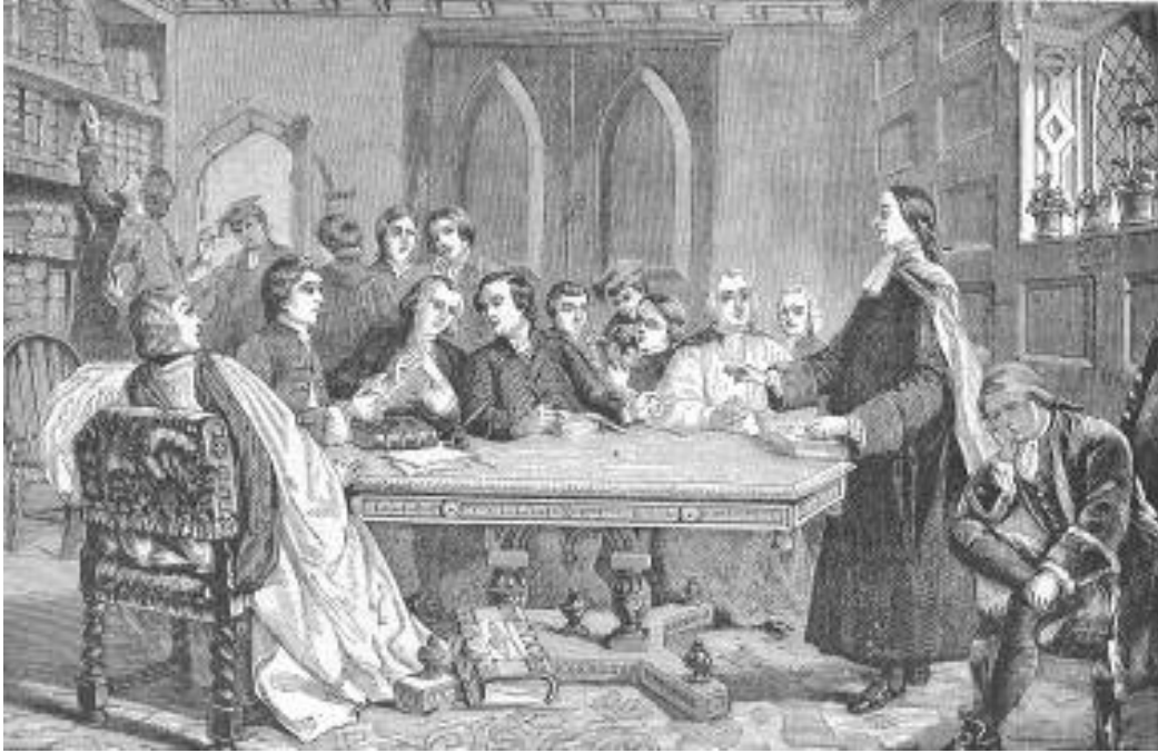
John Wesley and the Holy Club

John Wesley (1703-91) was born as the fifteenth child of British clergyman Samuel Wesley. He was educated at Charterhouse School and Christ Church at the University of Oxford. In 1725 he was ordained as a deacon in the Church of England and three years later was admitted to the priesthood. While at Oxford he joined the Holy Club, a group of students who 'methodically' held to religious practices and precepts such as visiting the sick and those in prison. Eventually this society came to be teased as the 'Methodists'.