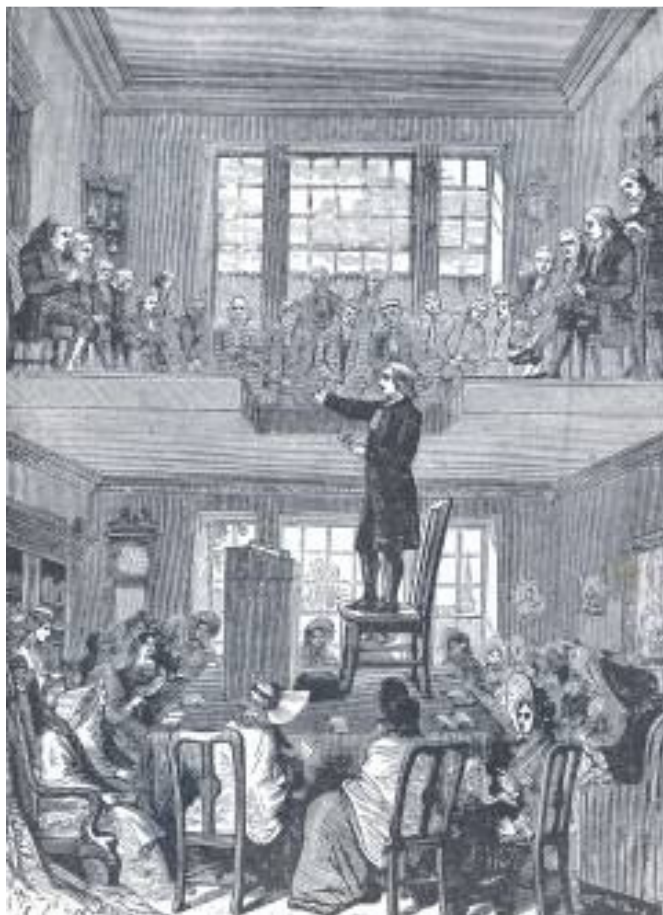
John Wesley, An Unusual Minister In A Usual World

John Wesley's ministry was characterized by the Holy Spirit dealing with unsaved people in very unusual ways. The unsaved were sometimes hit by strong guilt, weeping, convulsions and other physical affects to their bodies. While these affects seem to have generally left the church of