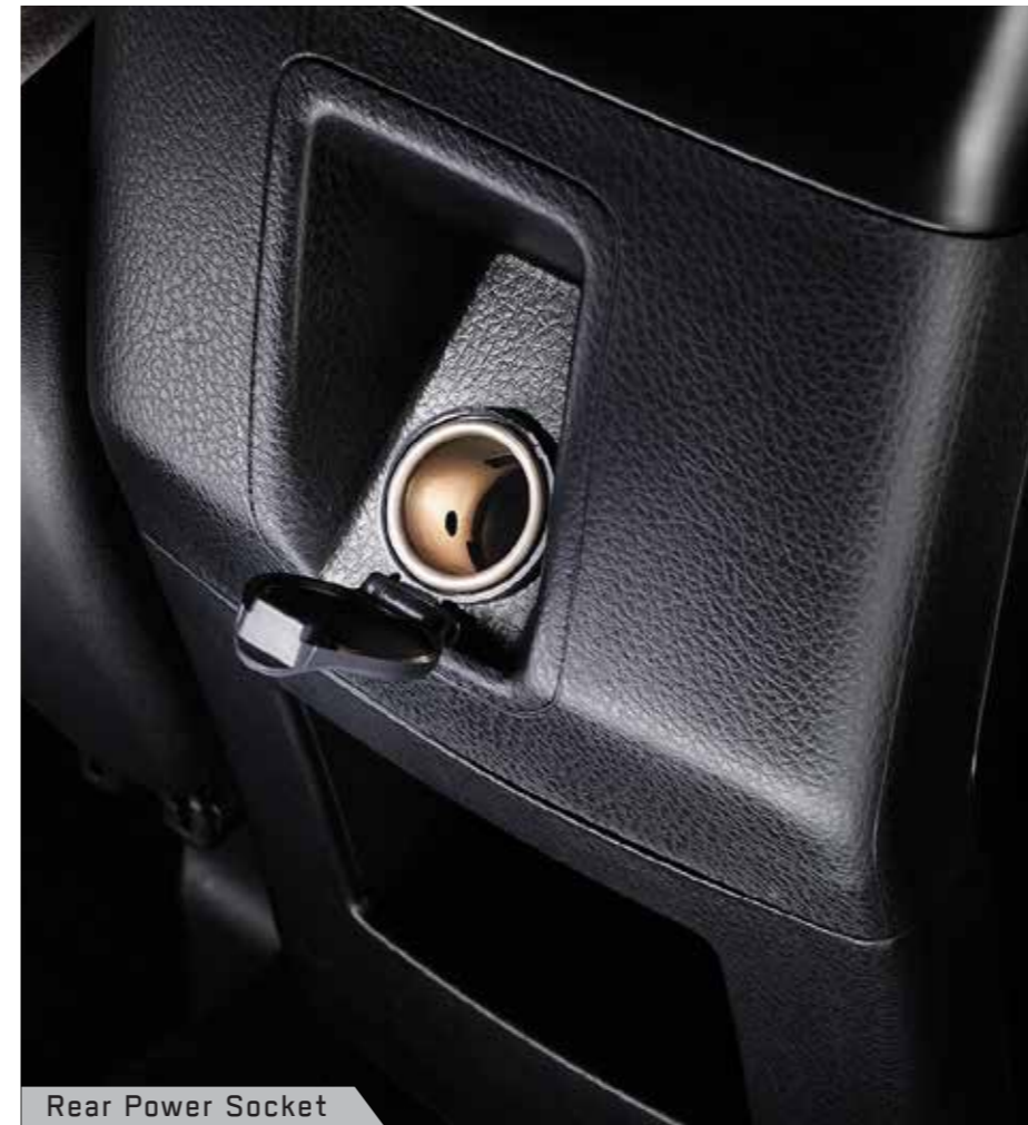
Rear Power Socket