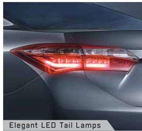
Elegant LED Tail Lamps