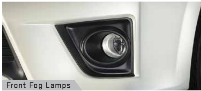
Front Fog Lamps