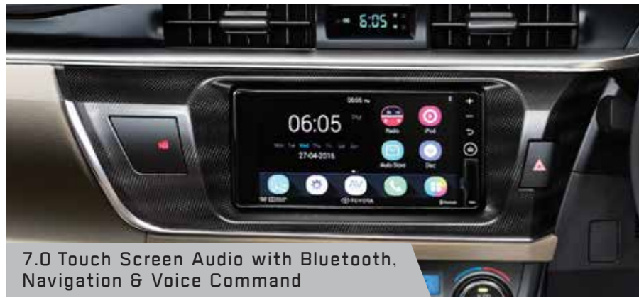
7.0 Touch Screen Audio with Bluetooth, Navigation & Voice Command