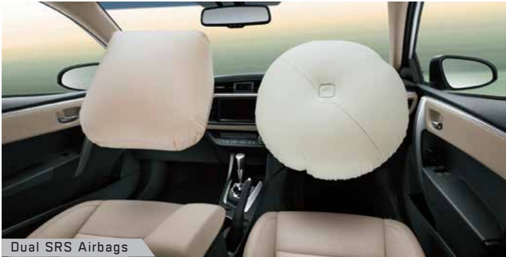
Dual SRS Airbags