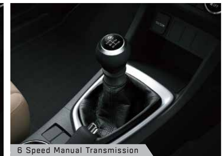
6 Speed Manual Transmission