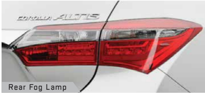
Rear Fog Lamp