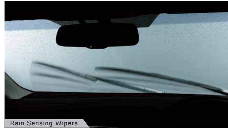
Rain Sensing Wipers