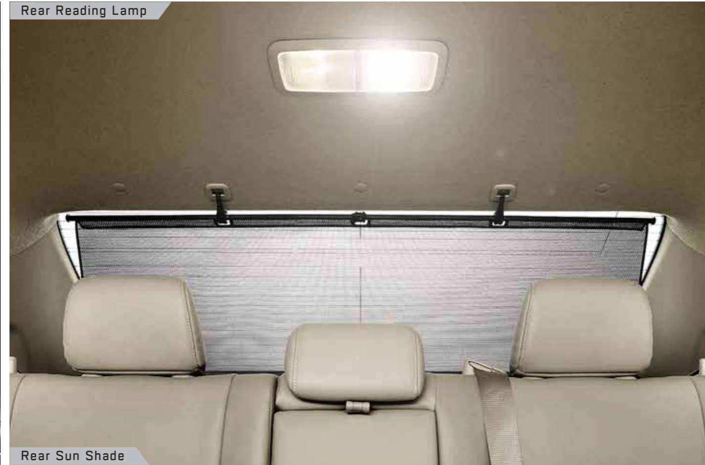
Rear Sun Shade