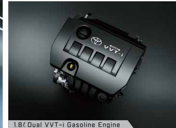
1.8ℓ Dual VVT-i Gasoline Engine