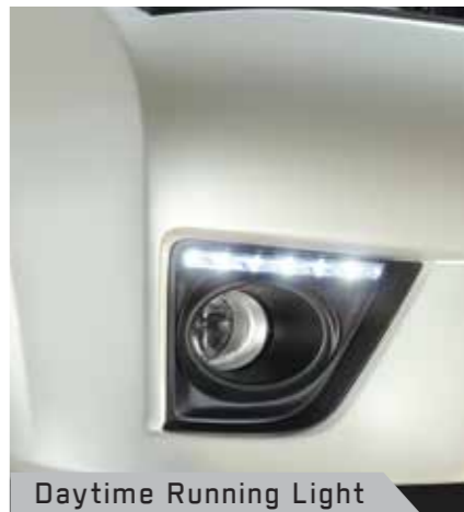
Daytime Running Light