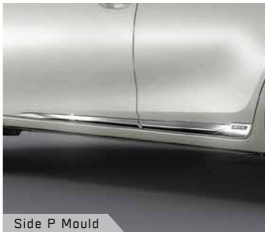
Side P Mould