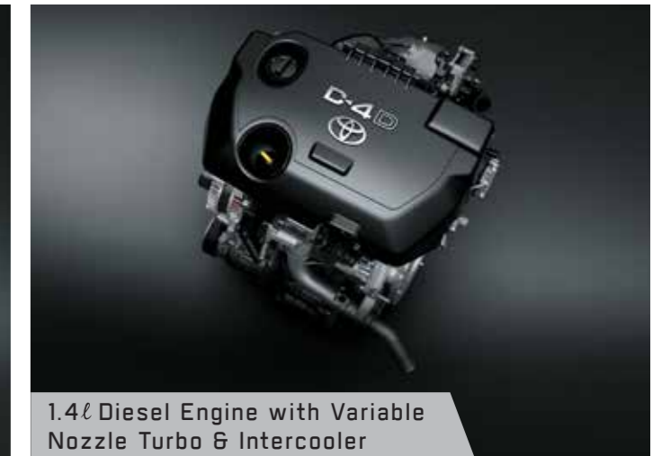
1.4ℓ Diesel Engine with Variable Nozzle Turbo & Intercooler