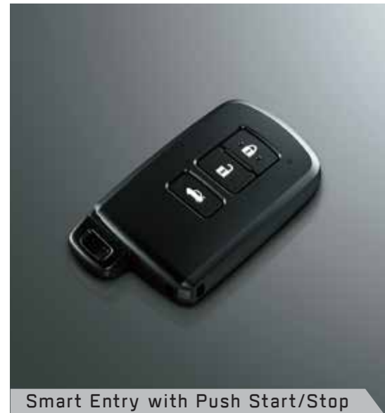
Smart Entry with Push Start/Stop