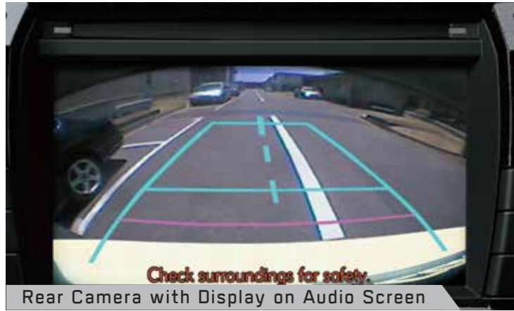
Check surroundings for safety. Rear Camera with Display on Audio Screen