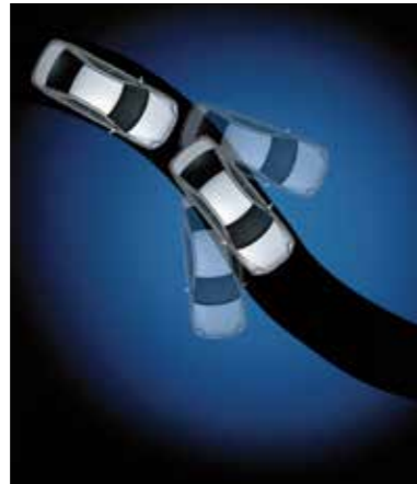
Vehicle Stability Control (VSC)