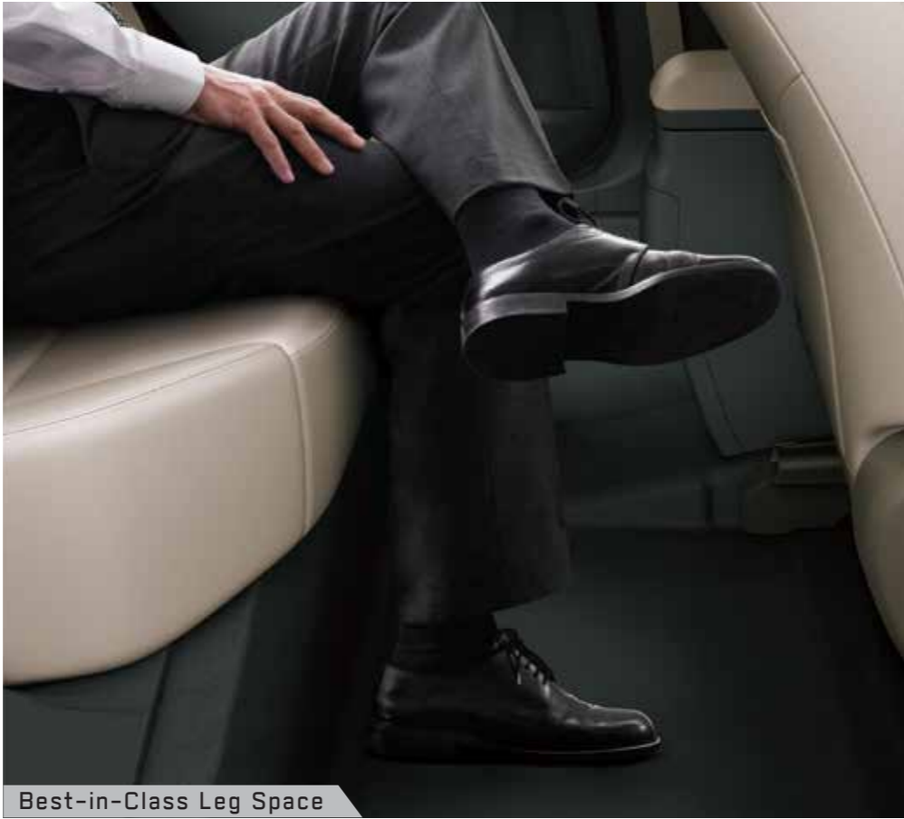
Best-in-Class Leg Space