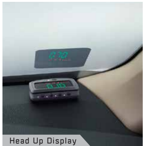
Head Up Display