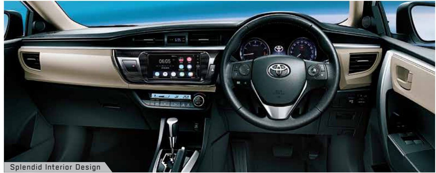
Splendid Interior Design