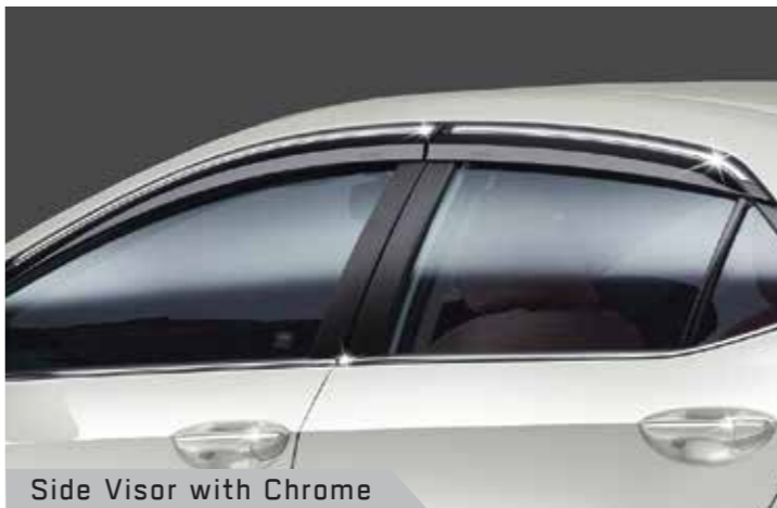
Side Visor with Chrome