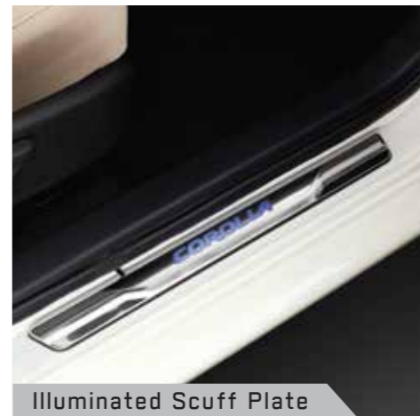
Illuminated Scuff Plate