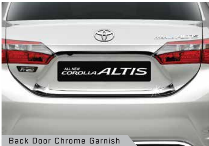
Back Door Chrome Garnish