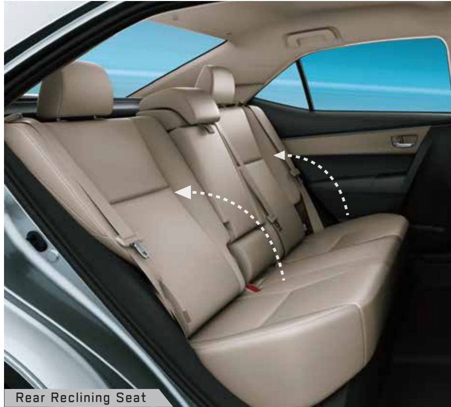
Rear Reclining Seat