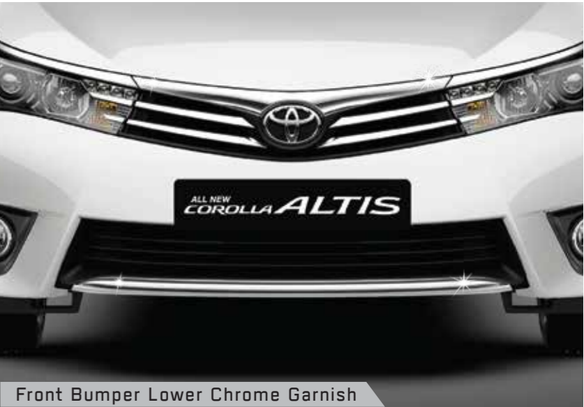
Front Bumper Lower Chrome Garnish