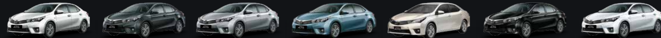
White Pearl Crystal Shine

**Options Available as Accessories at Dealer