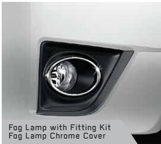
Fog Lamp with Fitting Kit Fog Lamp Chrome Cover