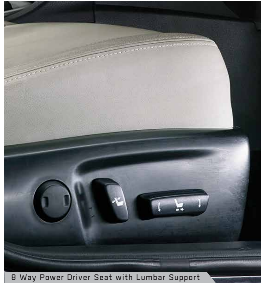
8 Way Power Driver Seat with Lumbar Support