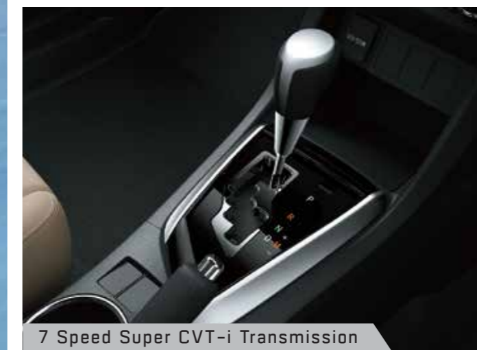
7 Speed Super CVT-i Transmission