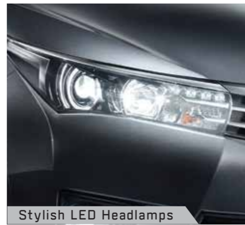
Stylish LED Headlamps