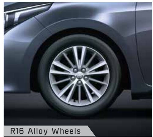
R16 Alloy Wheels