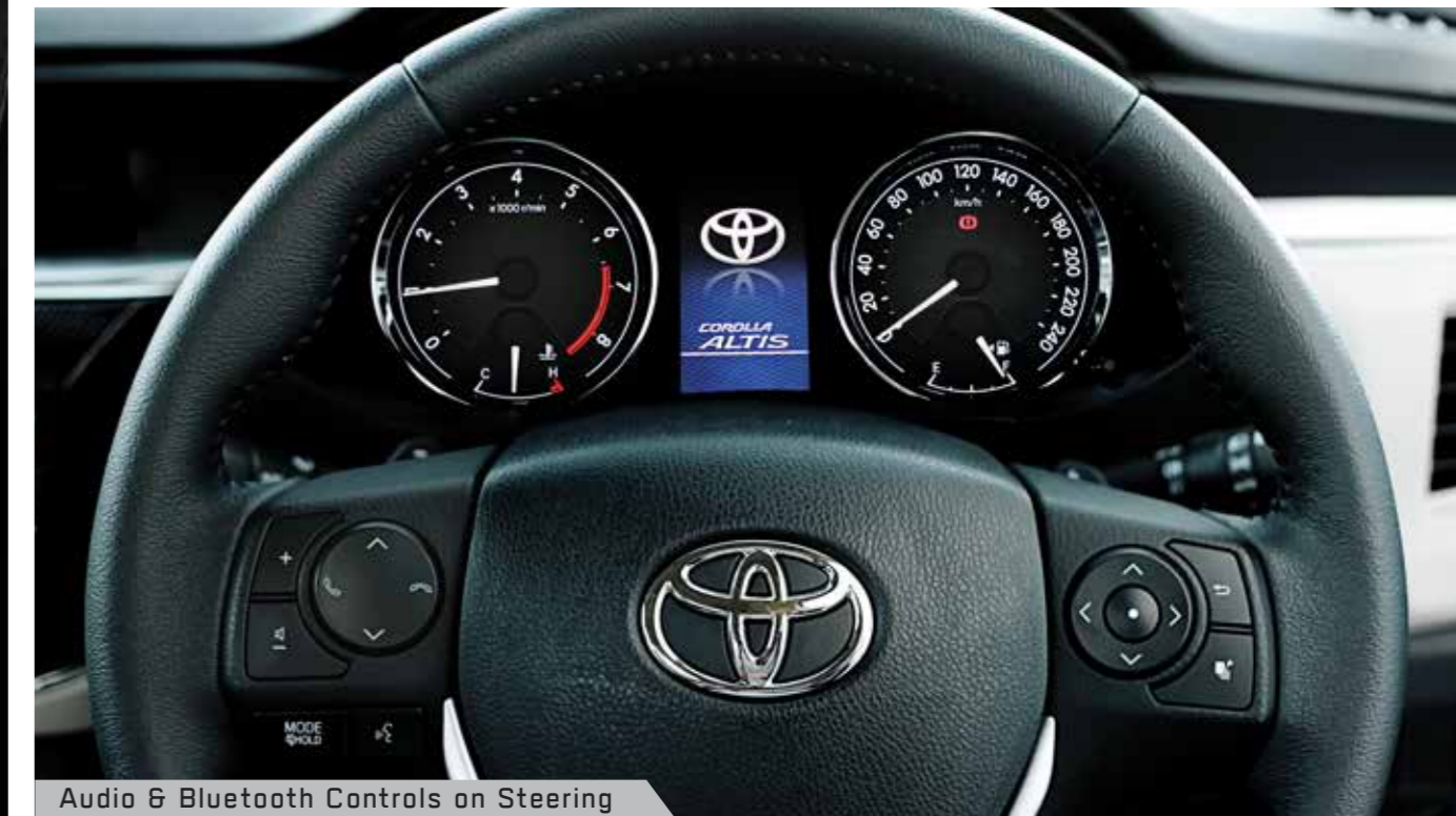
Audio & Bluetooth Controls on Steering