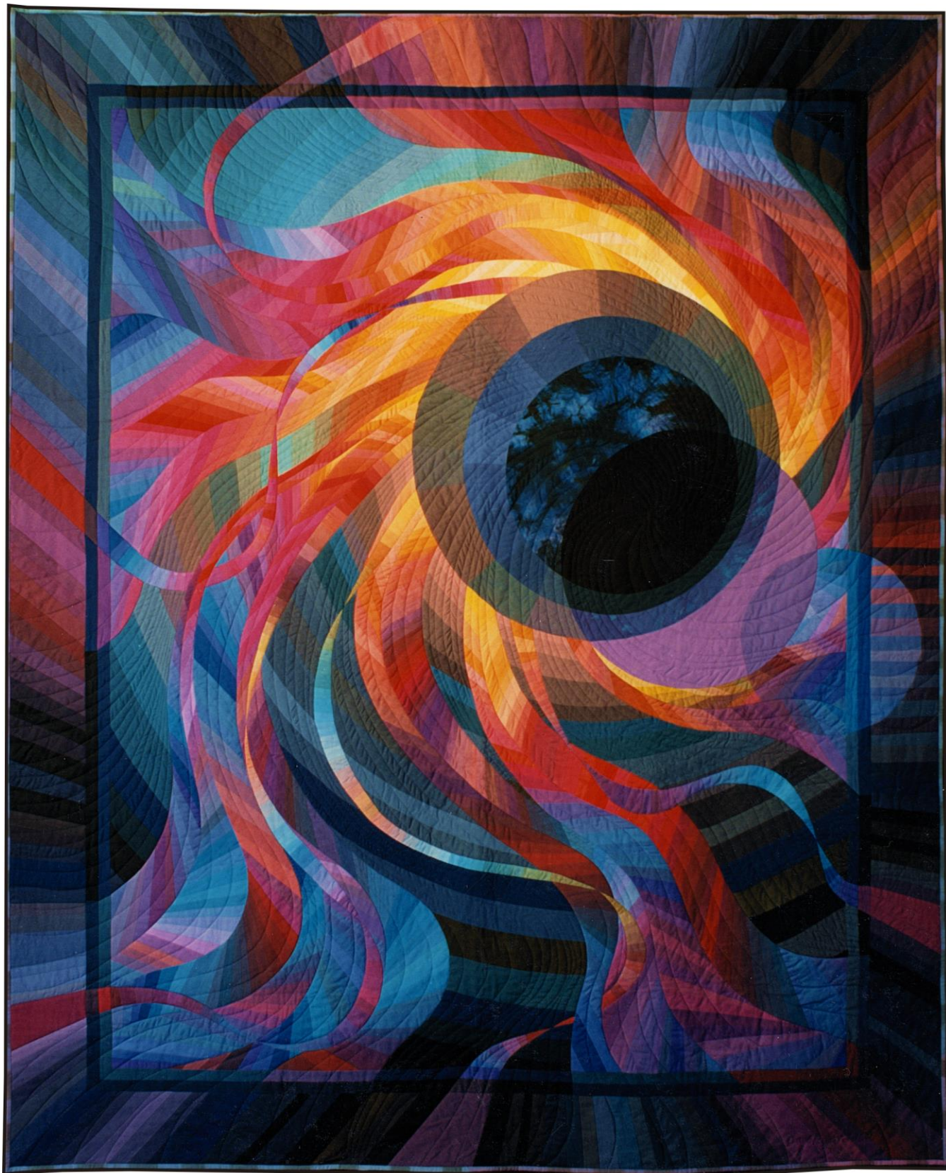
Corona 2: Solar Eclipse • 1989 • 76" x 94" • © Caryl Bryer Fallert • Bryerpatch Studio

Bryerpatch Studio • 10 Baycliff Pl. • Port Townsend, WA 98368 • caryl@bryerpatch.com • www.bryerpatch.com