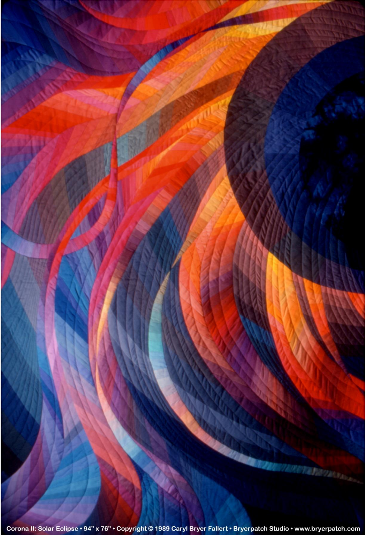
Corona II: Solar Eclipse • 94" x 76" • Copyright © 1989 Caryl Bryer Fallert • Bryerpatch Studio • www.bryerpatch.com

Bryerpatch Studio • 10 Baycliff Pl. • Port Townsend, WA 98368 • caryl@bryerpatch.com • www.bryerpatch.com