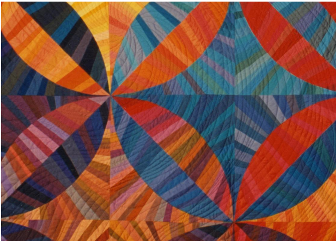
Corona II: Solar Eclipse (back detail) • 94" x 76" • Copyright © 1989 Caryl Bryer Fallert • Bryerpatch Studio • www.bryerpatch.com