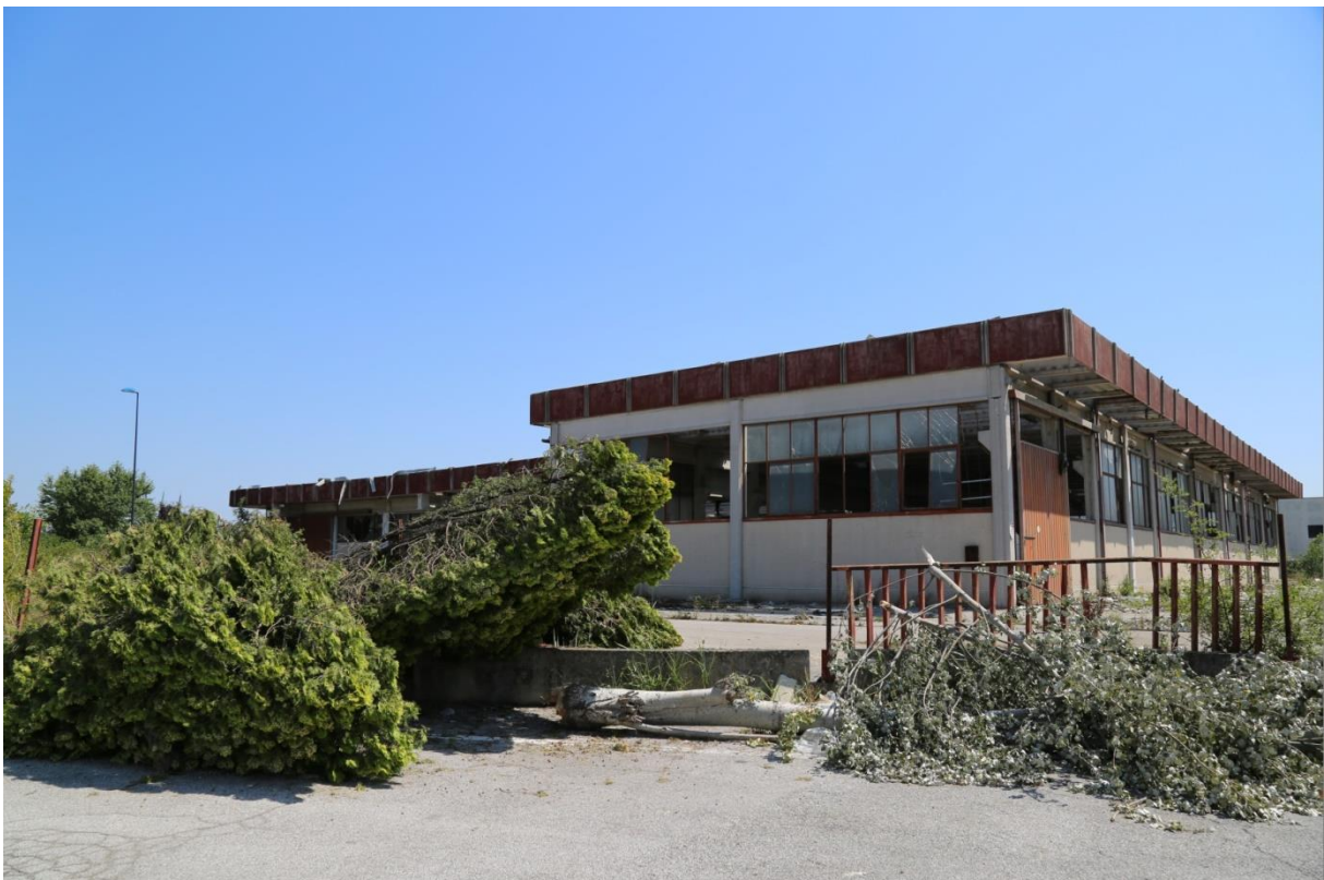
Image 2: F2 damage in Cazzago industrial zone

In Cazzago the tornado first went through an industrial zone and then through the town center with mainly F2 intensity.