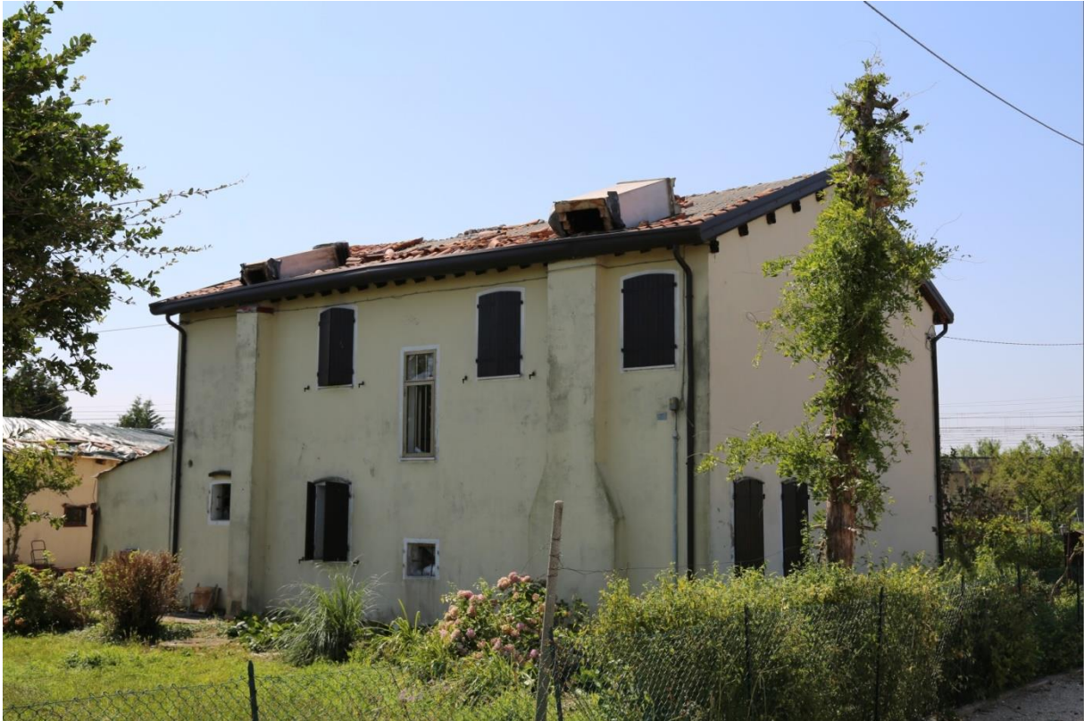
Image 1: Significant roof damage on a strong brick building (F2) in Pianiga

In Cazzago the tornado first went through an industrial zone and then through the town center with mainly F2 intensity.