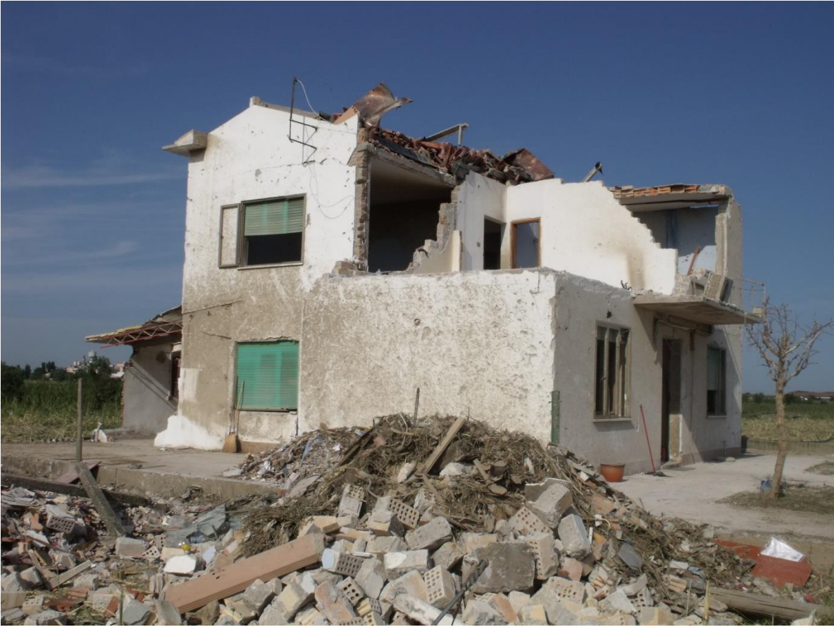
Image 7: South Mira F3+ damage (weak brick structure, walls partly collapsed)

South of the Naviglio del Brenta the tornado still maintained an intensity of F4 or upper F3 for some time. A high voltage electric power pole was twisted and collapsed. Then the tornado reached open fields and then the southern settlements of Mira – still with F2 intensity south of Piazza Vecchia.