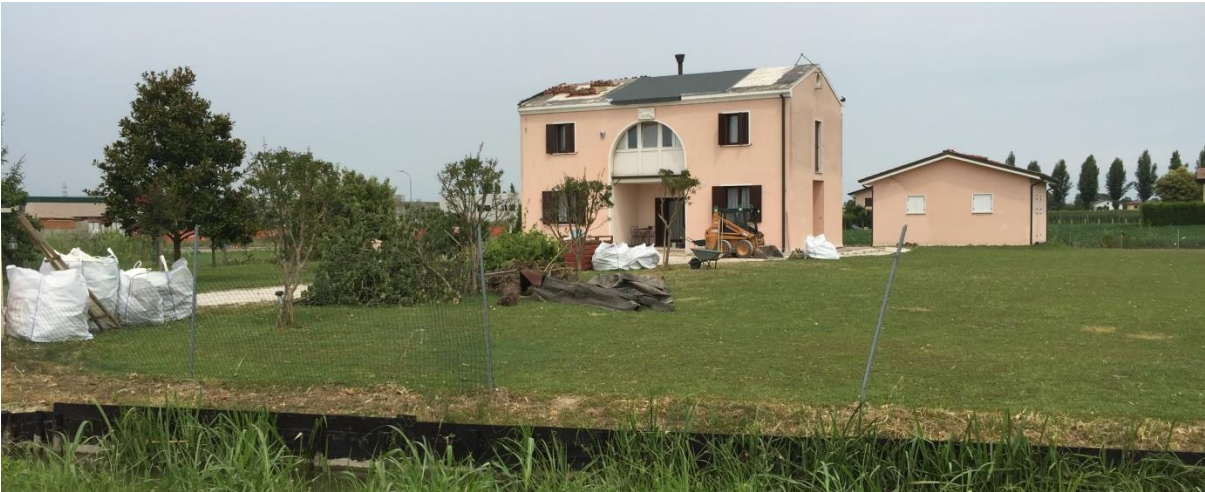
Image 8: F2 damage (strong brick structure, significant roof damage) in Piazza Vecchia

The last minor damage was visible at the easternmost farm before the coastal swamps (lagune) and sand dunes of the Adriatic Sea.