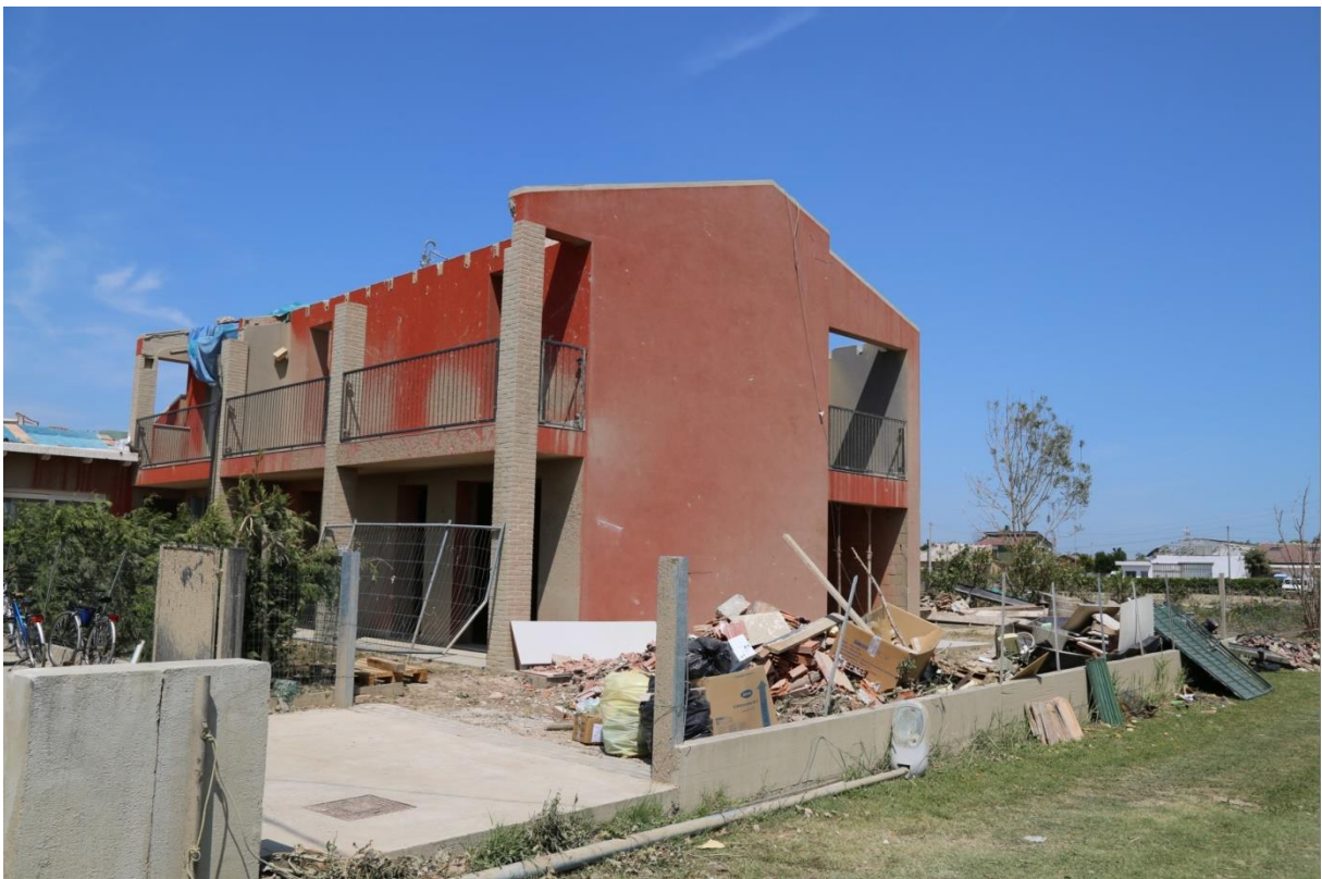
Image 4: F3 damage (strong brick structure, roof gone) to a house in eastern Dolo

In the eastern neighborhoods of Dolo F3 intensity was typical close to the tornado center and many houses were badly damaged.