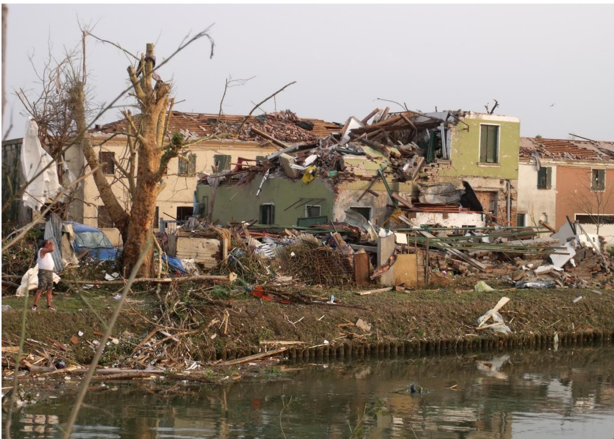
Image 6: F4 damage (strong brick structure, walls partly collapsed) in western Mira close to the Villa Fini, on the other side of the streamer