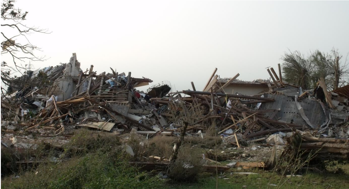
Image 5: Remnants of Villa Fini (F4, collapsed weak brick structure) in western Mira

The western neighborhoods of Mira experienced the worst tornado impact. A few buildings were rated F4, including the historical Villa Fini. This villa was assumed to be a “weak brick building” damage indicator because of the very aged and crumbly mortar in between the bricks. This building totally collapsed.