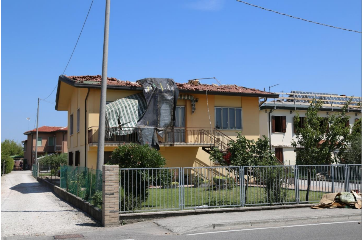
Image 3: F2 damage (significant roof damage to strong brick structure) in Cazzago

In the eastern neighborhoods of Dolo F3 intensity was typical close to the tornado center and many houses were badly damaged.