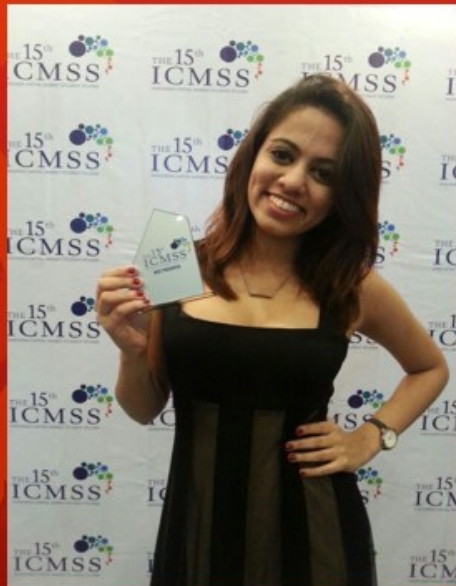
Best Presenter Award