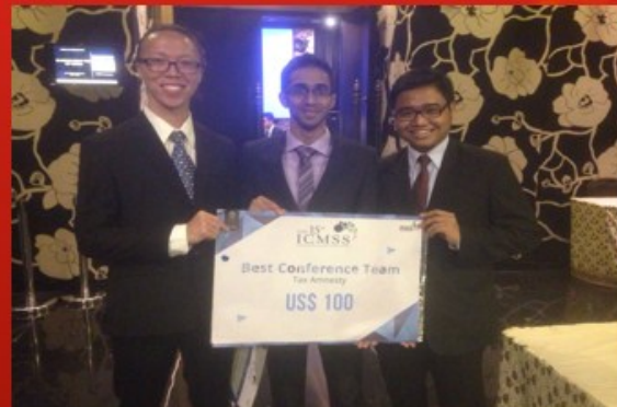
Best Conference Team