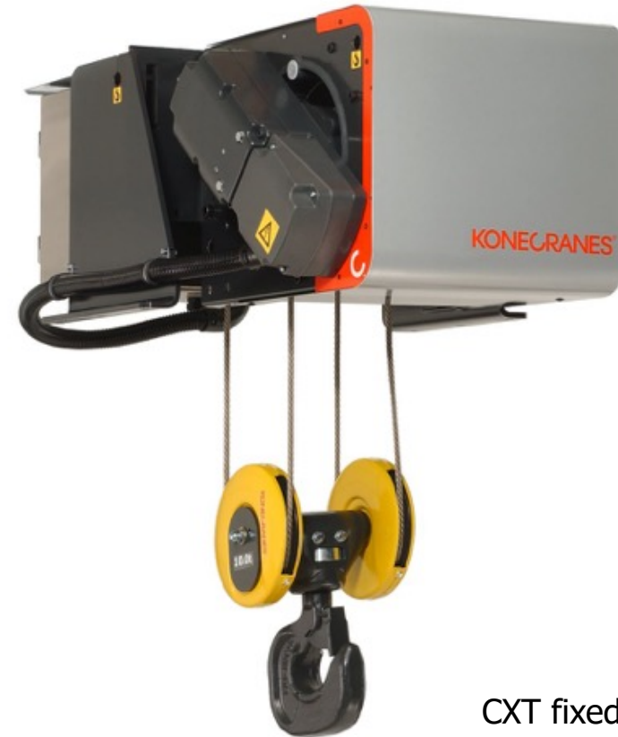
CXT fixed hoist