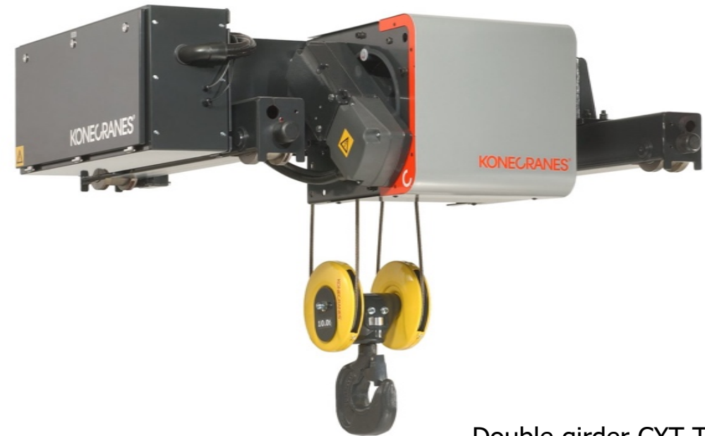
Double girder CXT Trolley

The CXT hoist has many features that ease load handling and maintenance. With Adaptive Speed Range (ASR), the motor speed varies according to the load. This allows for optimal speed and enhanced safety when handling heavier loads. Its service-friendly reeving design provides improved access to the upper rope sheaves and overload device, making rope changes, rope length adjustments and sheave replacements fast and easy.