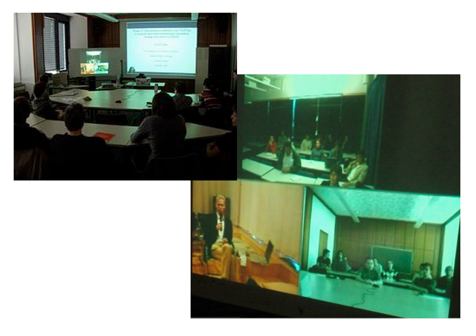
Figure 1 – Snapshots from teaching the course

become better net citizens and members of virtual teams, increasing their efficiency and creativity. Part of the course was taught from MIT, such that the course was distributed at three locations. Figure 1 illustrates the classroom teaching part of the course, where one virtual classroom was formed by participants from Helsinki, Cologne, and Boston.