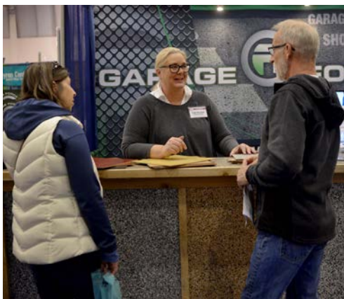
Demographics based on 2019 patron survey

77% made purchases at the show! 32% plan to purchase a product seen at the show within 6 months!