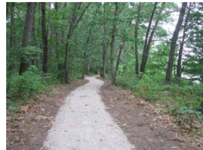
New crushed stone path