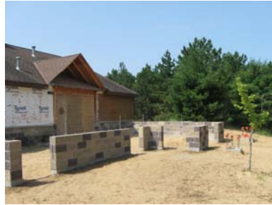
New masonry foundation wall