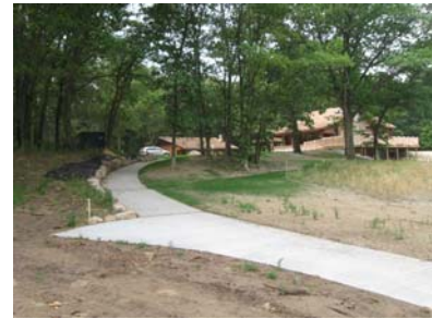
Barrier free walkway