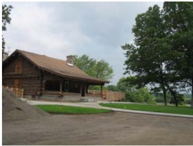
Cabin entrance area

Connor Bayou: Work along the waterfront has been permitted by the MDEQ but is delayed as we await final approval by the Corps of Engineers. Other aspects of project are nearing completion and should be ready by the original project completion date of mid-August. The park is expected to open on August 18 for the Greenway Celebration Community Picnic and remain open to the public thereafter. Major items completed in the past month include installation of the irrigation system, seeding, and widening of the entrance drive. Work on the bayou overlook deck and entrance boulevard is in progress. The fishing dock and boardwalks related to the waterfront trail will be delayed until the Corps permit is issued.