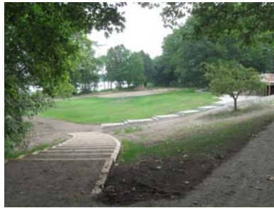
View over main lawn area