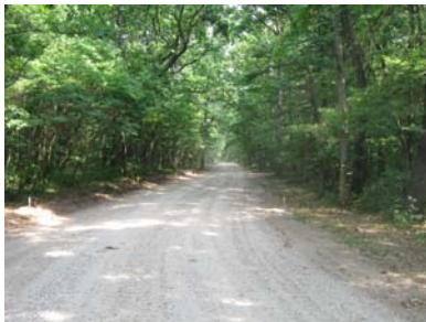
Widened entrance drive