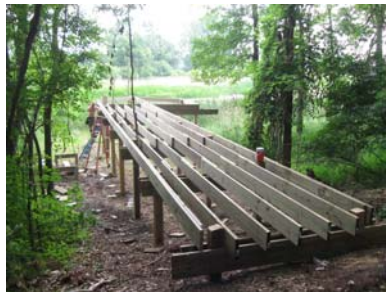
Bayou overlook deck framing