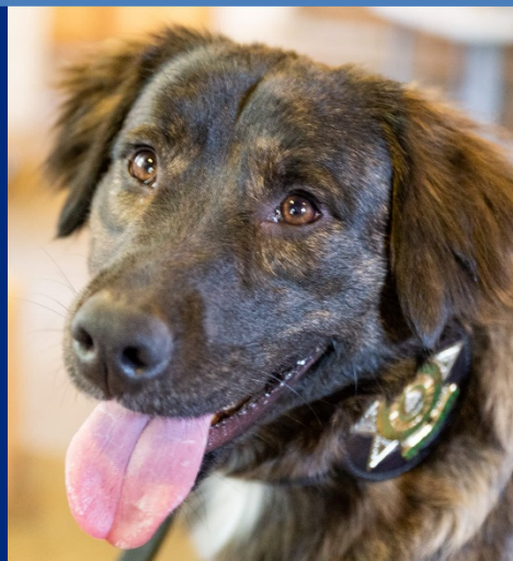
Agricultural Canine Detector

San Bernardino County seeks an expert in the fields of Agriculture / Weights & Measures.