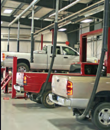
Retrofit & Upgrade Applications