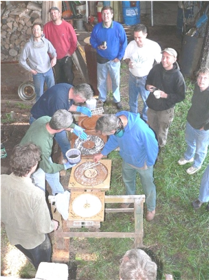
NO – this is NOT a barbeque!!

In addition to the normal Bondo brand polyester resin we’ve always used, we tried some new resin types that we found available in large quantities on the internet. We’ve always been somewhat concerned about casting strength on the 15 foot machines, and we’ve used West System epoxy for the big magnet rotors successfully in the past, though it’s very expensive. The new epoxy we tried ended up being too brittle for comfort, so the new owner of the machine will be re-casting them. The new vinyl ester resin we tried for the big machine’s stator was a success—stronger, more heat resistant, and just as easy to mix and cast.