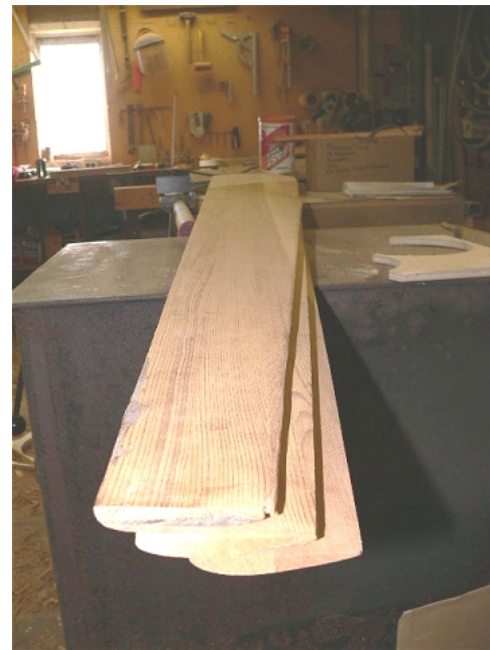
Three nicely carved blades, with a bit of epoxy and sawdust mix added to fill the voids.

The 7.5 foot turbine blades were a lot of work, with lots of material to be removed. They took all week, with different people rotating into blade carving chores. The 3.5 foot blades for the 7 foot machine were a quick, fun project. We didn't bring wood for them with us, and we enjoyed the very rural setting of Mick's shop and nearby Algoma, WI so much that we were loathe to drive to the 'big city' (Green Bay or Sturgeon Bay) to locate suitable wood at a lumberyard.