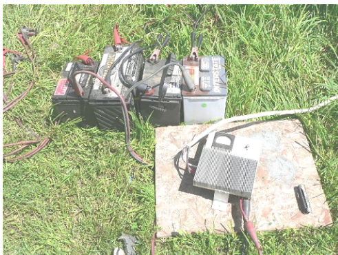
Four borrowed car batteries make our 48 volt battery bank for testing, and a rectifier assembly with ammeter and shutdown switch change the ‘wild AC’ output of the wind turbine into usable form.

Many students thought we were joking when we asked for volunteers who would loan us their car battery for the test flight. The machine was wound for 48 volts, and we didn’t have a 48 volt battery bank available, so we put four car batteries in series with jumper cables for the test.