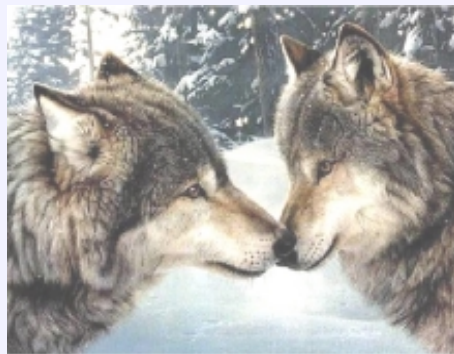
Rebel Wolf Energy Systems