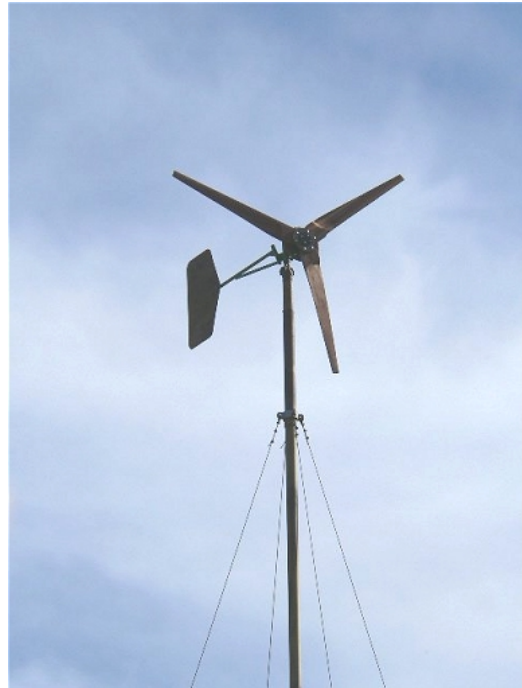
A nice little 10 foot wind turbine flying on the test tower. It spun up to 1 kW output quickly in the strong breeze we had, exceeding our expectations.

A band of thunderstorms was rapidly approaching off of Lake Michigan, and students nervously monitored their cell phone weather maps as we got every last detail covered. The turbine went up smoothly, dropped its tail into operating position, and immediately spun up. We had meters attached, and the turbine hit one kilowatt output (1kW) quickly and just sat there at that power output in the strong breeze. It exceeded our expectations – we would have been quite happy at 800 Watts, and we told everyone to expect only 600 Watts.