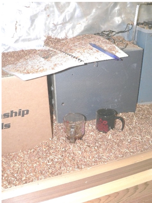
One hazard of blade carving. “Wow, my coffee sure has a gritty, resinous taste this morning!