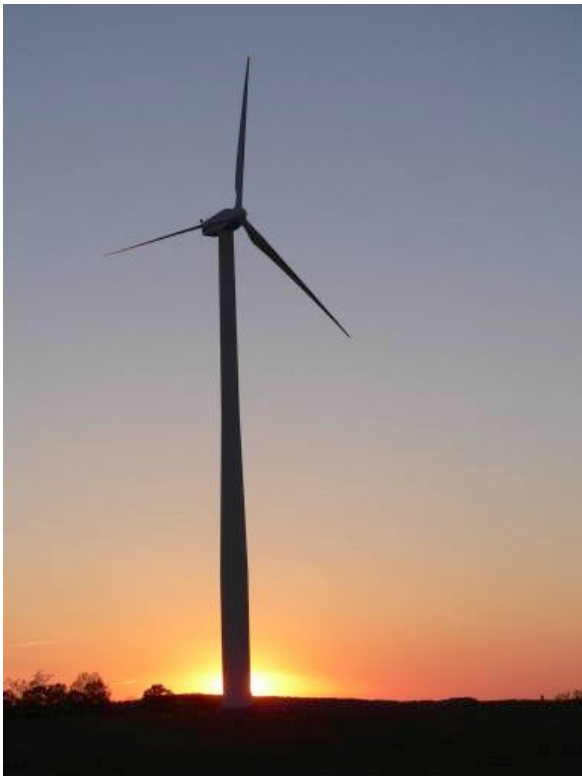
A 660 kW Vestas wind turbine, located about 2 miles from our seminar workshop. It was impressive to watch these machines in action

The view from Mick's house is, appropriately, filled with wind turbines—he flies a vintage Jacobs 14 footer that's grid-tied. Every dairy farm in the area has an old waterpumper in the yard too, but the most dramatic turbines in sight are big ones—660 kW Vestas on 210 foot towers.