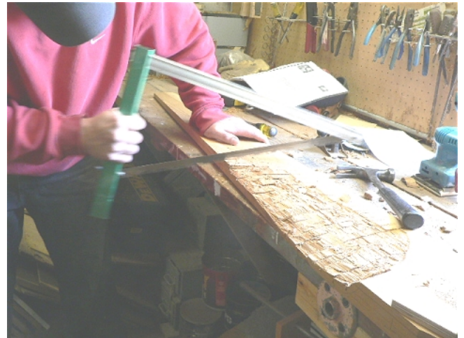
A coarse-toothed bow saw turned out to be an easy way to make the straight, deep kerfs at the blade roots.

This worked out well, as we wanted to demonstrate that only a minimum of power tools are needed to make a turbine. It COULD be done with only hand tools and no electricity, but would be much more time consuming. The combination of a bow saw for cutting the deep kerfs near the blade root, a drawknife for rough shaping, a power planer for bringing things down to their exact proper thickness, and a power palm sander for finishing proved to be fast and efficient. We started two groups of students on 7.5 foot and 5 foot blades on day one, to be sure they would be finished in time. Our group of students were extremely excited to both learn and teach—so after someone mastered, for instance, how to carve and shape a blade, they then taught another group of students how to handle the tools, what to watch out for, and such.