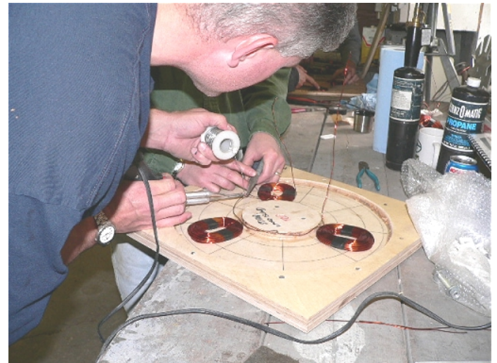
Wiring the first phase coils in series. We do it in the mold so all the wire lengths all come out right.

While the molds were being fabricated and blade carving (continually) proceeded, another crew fabricated a coil winder. With a little simple welding and woodworking, a sturdy coil winder can be made that will work for many turbines. By changing the shaped core insert piece, coils of many different sizes and shapes can be wound on the same machine. Students made interchangeable cores and wound the coils for all three machines on the winder that they built.