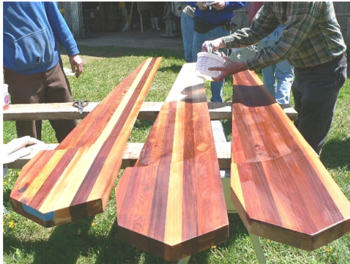
The 7.5 foot blades for the 15 foot turbine were daunting in their size and how much material had to be removed while carving – but the finished product was beautiful! Here the big blades are getting their first coat of finish.

It's a big expense and difficult to apply properly in a home workshop, so here we stuck with linseed oil. It is interesting to see what results folks all over the world, in vastly different climates, are having with various blade finishes—many are sharing their information on the internet. (See 'internet resources' at the end of this article for homebrew wind power discussion groups and mailing lists)