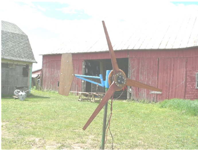
The cute little 7-foot machine, ready to begin its nationwide tour of renewable energy fairs with the MREA. Don't let turbines spin on the test stand! Short them out and tie the blades down.

After the day of the exciting test flight, the 7 foot and 15 foot machines still needed final assembly. Both came out beautifully – the 7 footer is adorably cute and tiny, while the 15 footer is daunting in its scale. The 7 foot machine will be touring the country with the MREA at renewable energy fairs, no doubt with many questions as to why it has only one magnet rotor, and thus an incomplete magnetic circuit. The reasons are – simplicity and interchangeable parts. The small machine uses the same frame, magnets and magnet rotor as the 10 footer, and the stator is the same size. It's not the most cost-effective use of the magnets – but the magnet bill is still half what it would be for the 10 foot machine, and we could use all the same molds for building it.