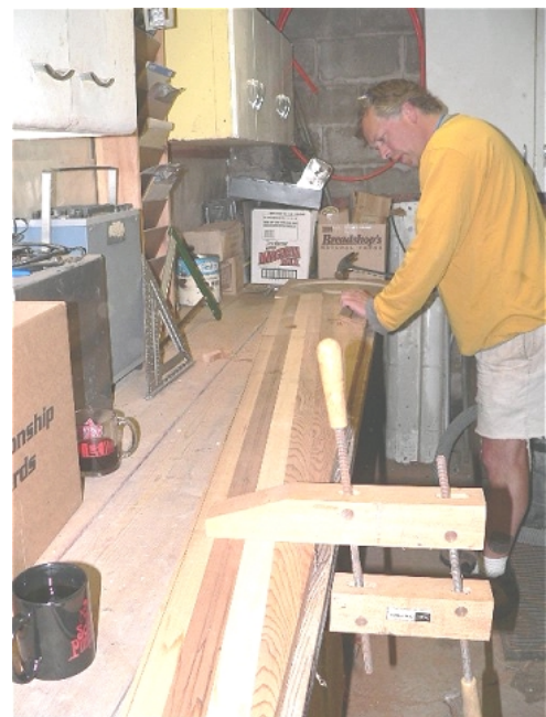
Clay from the MREA uses a mallet and chisel on a 7.5 foot blade to remove wood chunks that were kerfed out with the bow saw.