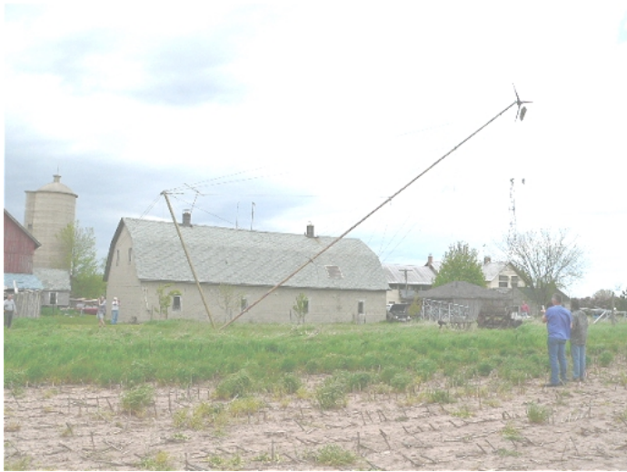
The 10 footer turbine gently rises into place, as thunderstorms off Lake Michigan loom. Each pair of observers has been assigned a specific task during the raise – everyone else is watching from outside the ‘fall zone’.

Mick gave the lecture on tower raising safety, and assigned people to different tasks—watching a set of guy wires for problems like too much strain or a tangle, directing the tractor driver during the raise, and so on. The 80 foot tilt-up tower was beefy, one of Mick’s designs that was sold by Lake Michigan Wind and Sun. Anyone with no task had to stand well away from the possible ‘fall zone.’ The ground was grassy and slippery with recent rain, so the raise was quite exciting – the tractor started to spin its wheels. Mick solved that problem by adding extra weight to the back of the tractor, and chaining student Helen’s SUV to the back of the tractor too. The tractor operator was always looking at the scene during the raise, and pulling in reverse – that’s the safe way to do it.