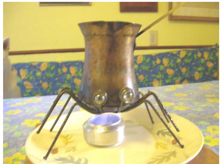
Little Miss Muffit's Revenge!