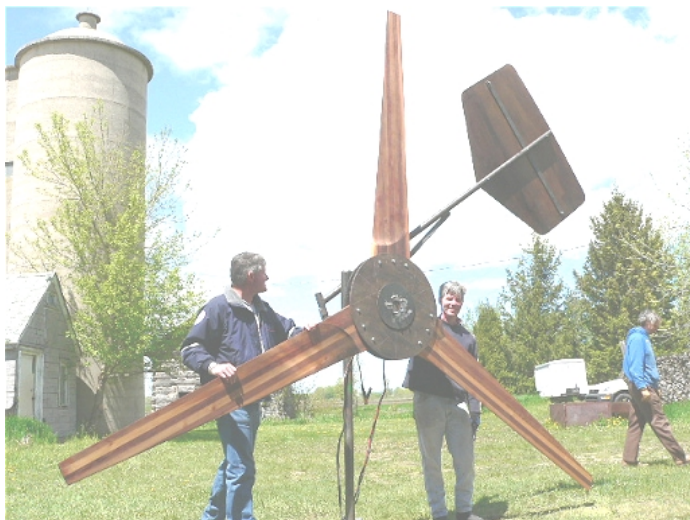
It's hard to visualize just how large a 15 foot diameter wind turbine is, until you have to remove it from the test stand and carry it across the yard!

The 10 foot turbine that we flew on Mick's test tower will have a new home at the MREA offices, on display for visitors. The 15 footer will soon be living on a farm in Kansas, and eventually be tied to the grid.