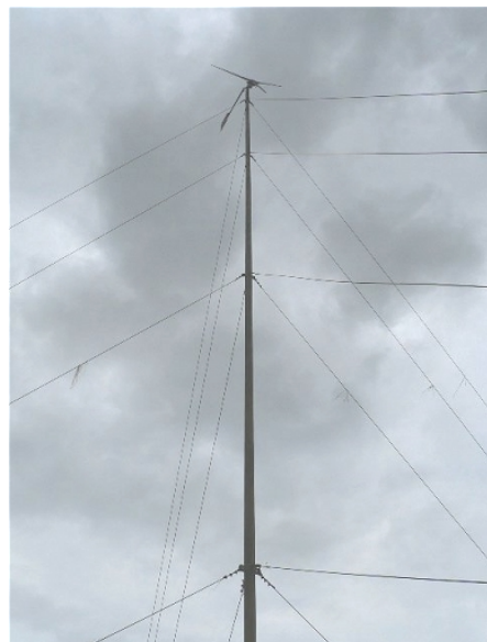
The 10 foot turbine looks tiny when observed from the ground, 80 feet below.