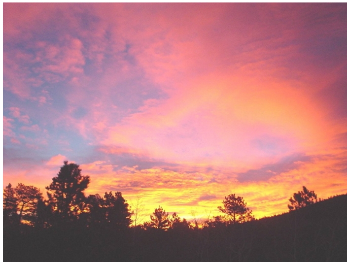
No reason at all for this picture – except I like it! (and it fills an awkward white space in the page)