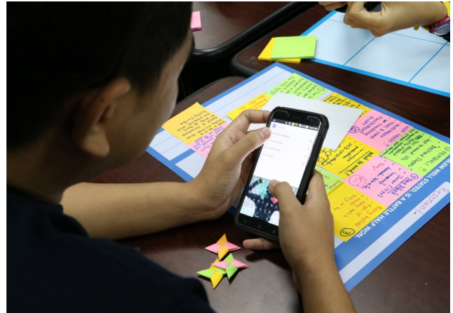
A youth using the U-Report platform during U-Report's Inisiatif Anak Malaysia workshop in 2019.

Surveys were also conducted through U-Report (online platform) to generate evidence informing UNICEF and partners' response to COVID-19.