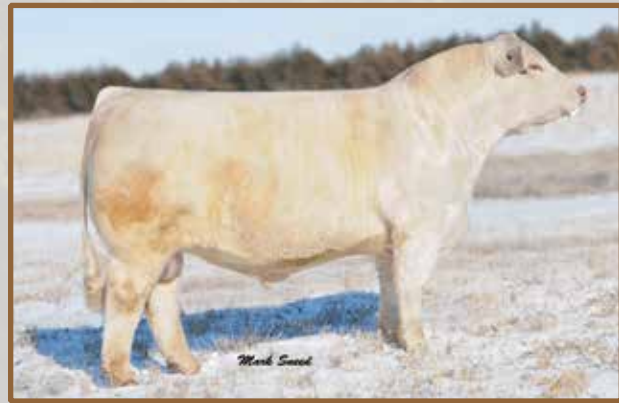
Rapid Fire, sire of Lot 7 ET calf