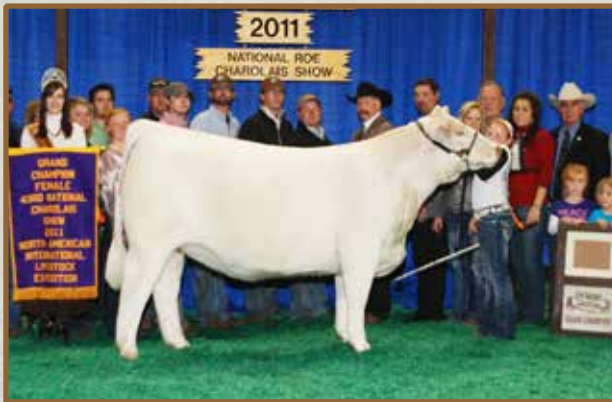
Ivory Angel, National Champion full sister to dam of Lot 14