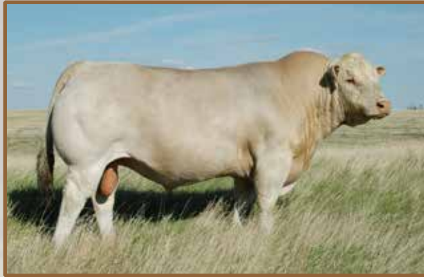
LT Ledger O332, service sire of Lots 56, 59, 61, 72 & 73