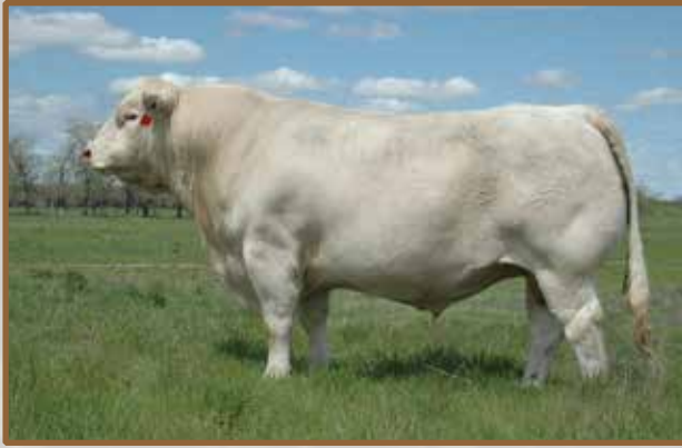
LT Bluegrass 4017, sire of Lot 51