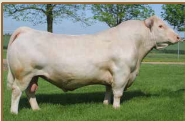
WC Big Ben, sire of Lots 37A, 39A & 40A.