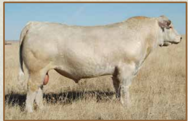
LT Long Distance, sire of Lots 54 & 55