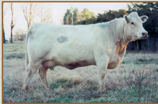
JWC Rich Lady, dam of Lot 3