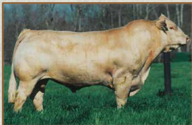
Baldrige Fasttrack 82F, sire of Lot 37 and maternal grandsire of Lot 35 & 36.