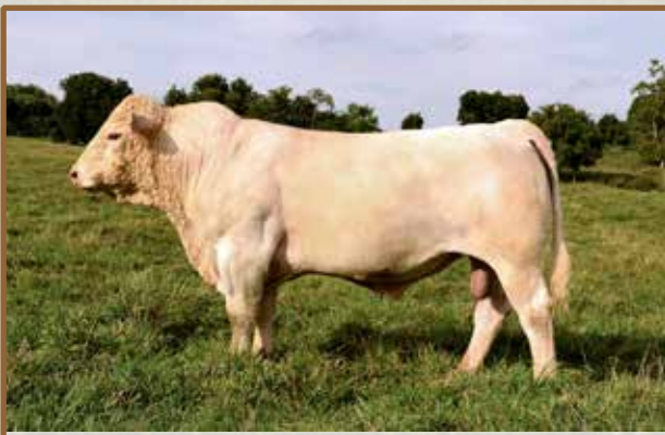
Cox Fastrack 1292, sire of Lots 67, 68 & 69

Lot 69 COX MISS FASTRACK 2319 4/10/2013 F1175088 POLLED