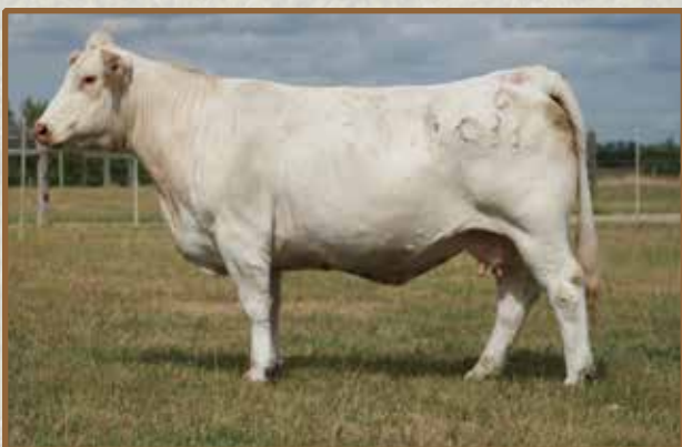
BCI Miss Verylimit 6033, Dam of #0641 and Lots 48, 49 and granddam of Lot 47