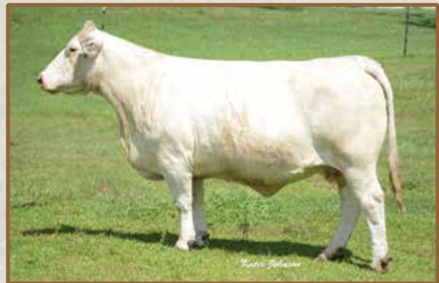
Thomas Ms Impressive 0641, granddam of Lot 14