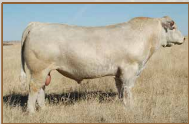
LT Long Distance, sire of many lots and service sire to many others