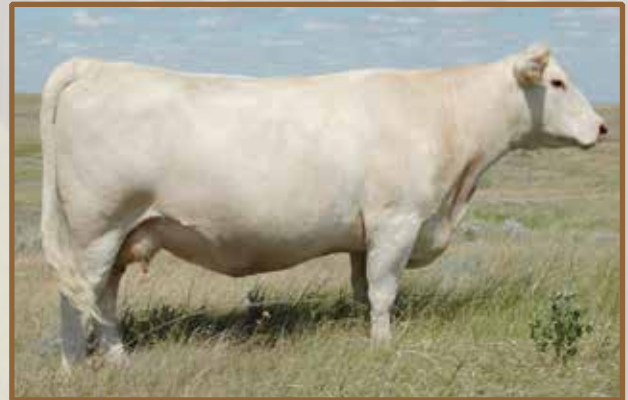
LT Brenda 6120 Pld, dam of LT Ledger O332P