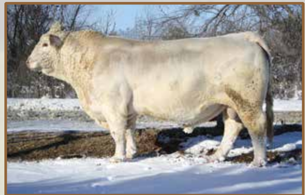
SR/NC Field Rep 2158 P ET, sire of Lot 20