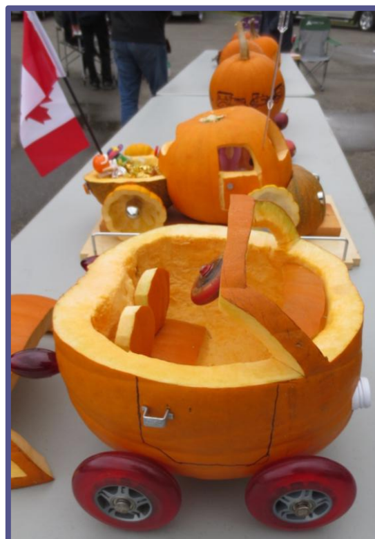
Some of the participants in the pumpkin CAR-ving contest at the "Almost Fall Tour", Saturday, October 17. Stay tuned for more photos in our November issue of the Crankshaft Journal.