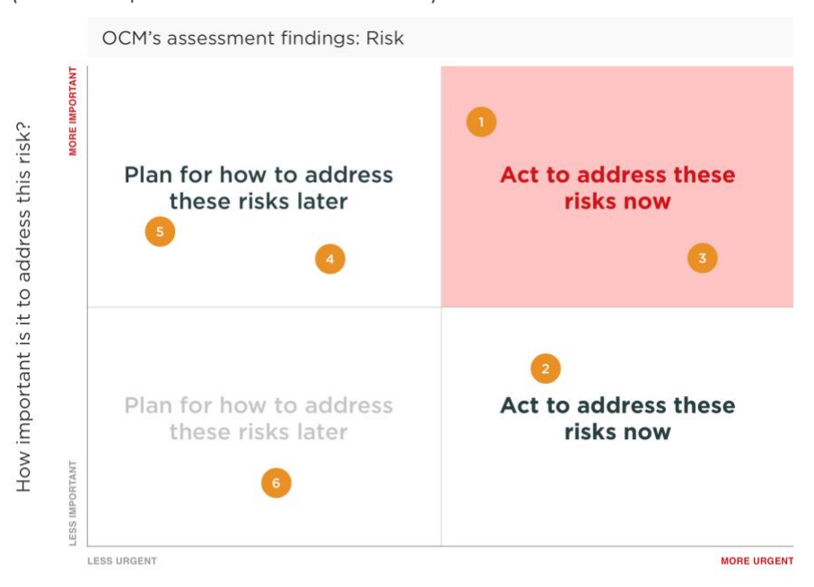
Figure 4 shows a one-page example format that you can use to start documenting your findings. (This example is for a risk assessment.)

How urgently do we need to address this risk?