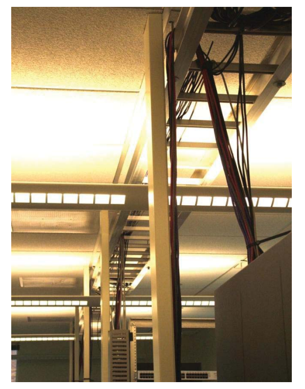
Illustration 4: The "ladder" carrying network cabling between rows of workstations. Note the bundle of cables rising obliquely from the server rack (right foreground) to the ladder, and vertical bundles of cables running from the ladder down to the trough below (not shown).

At the end of each row, network cables follow a riser to the ceiling, where they enter a horizontal ladder-like device (Illustration 4). This ladder runs perpendicular to the rows of desks, carrying network cables from row to row. Such cablecarrying ladders are common in newer construction; here, the difference is that the ladder is mounted below the ceiling so that cabling can be accessed without disturbing the ceiling tiles. The arrangement of troughs and the ladder permits re-routing and addition of network cables quite easily.