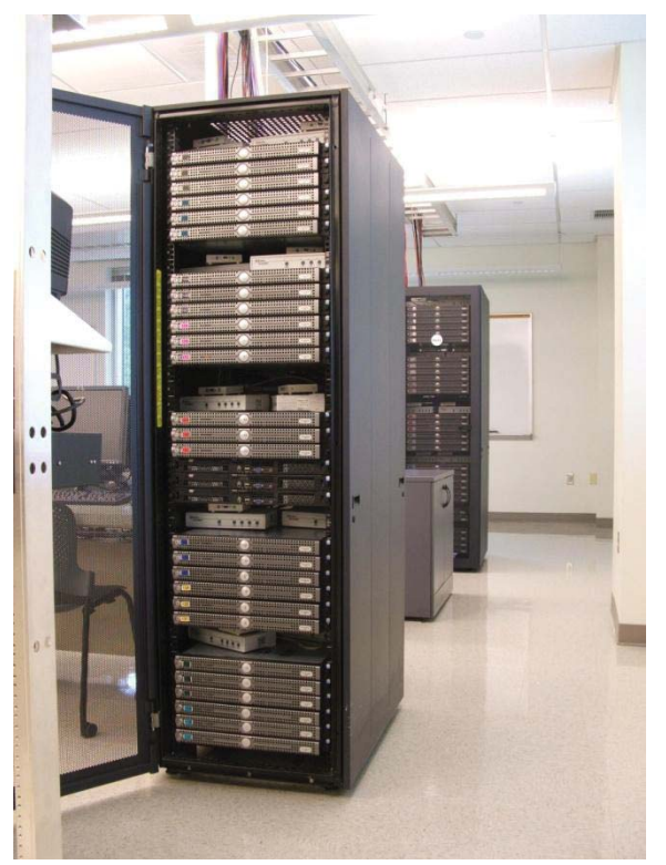
Illustration 5: Rack of 30 1-U servers. Note the boxes of KVM switches above each cluster of six servers. The bottom three servers in the middle cluster have their escutcheons removed to allow access the optical drives and USB ports.

networking software. Information Technology majors have had considerable scriptprogramming experience but have limited experience with general-purpose languages such as C++ or Java. All majors should get some experience working with existing network software.