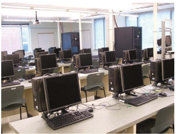
Illustration 1: View of the Network/Systems Administration Laboratory. Two of the three racks of servers can be seen in the background.

Eventually, during a campus-wide network upgrade, it became possible to route all outgoing packets from the lab directly to the university's Internet gateway. This worked out better than the original proposal, allowing software downloads in a one-step process, yet protecting the campus network from lab activity. It would be better still if faculty could turn this connection on and off, preventing Internet access except when needed for a particular lab project.