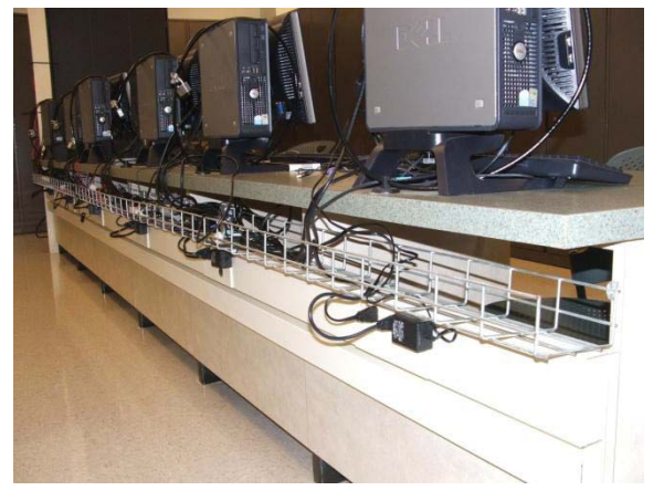
Illustration 3: View of a row of workstations, showing the wire trough for laying network cabling.

construction; here, the difference is that the ladder is mounted below the ceiling so that cabling can be accessed without disturbing the ceiling tiles. The arrangement of troughs and the ladder permits re-routing and addition of network cables quite easily.