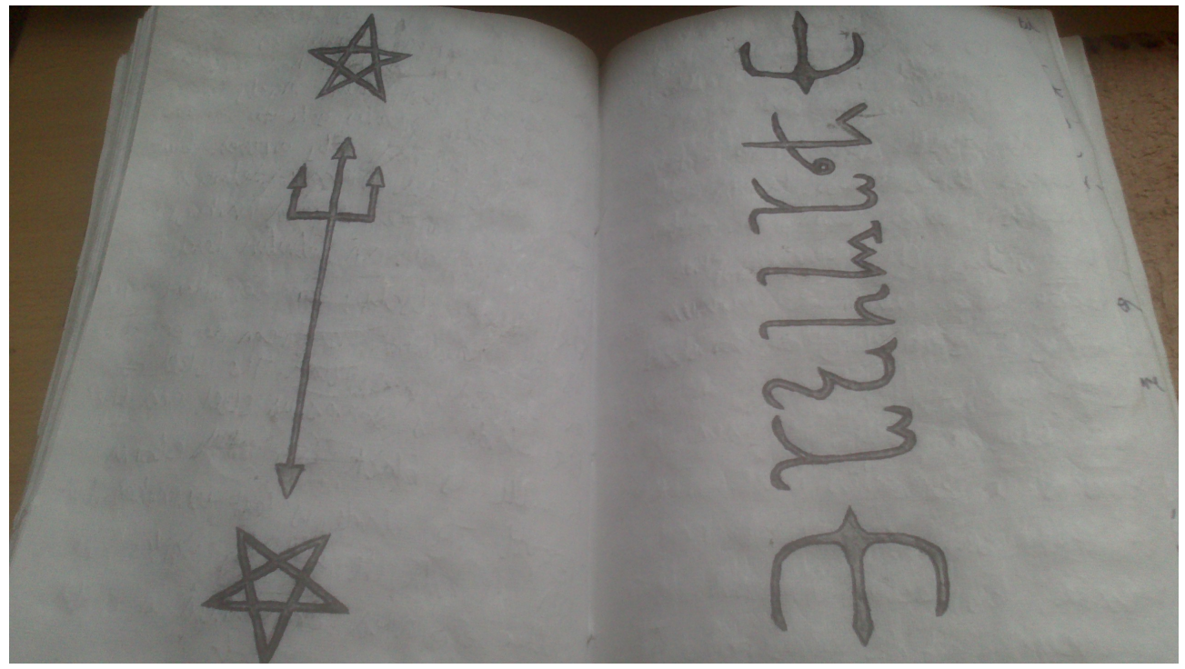
The Markings of the Blade of Arte

Note there are many physical ways the handle can be marked with the selected sigils of power. Ideally these would be carved naturally into the hilt, but they can also be painted or applied later as the practitioners skill allows.