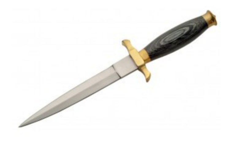
Example of a Tradtional Athame / Blade of Arte

Whilst the Blade of Arte seems to traditionally be a straight double edged, European style dagger complete with sword hilt, this does not mean that single edged, curved, or otherwise different designs are not fit for purpose. As long as the blade can be manipulated fine with one hand and has at least one cutting edge it should suffice.