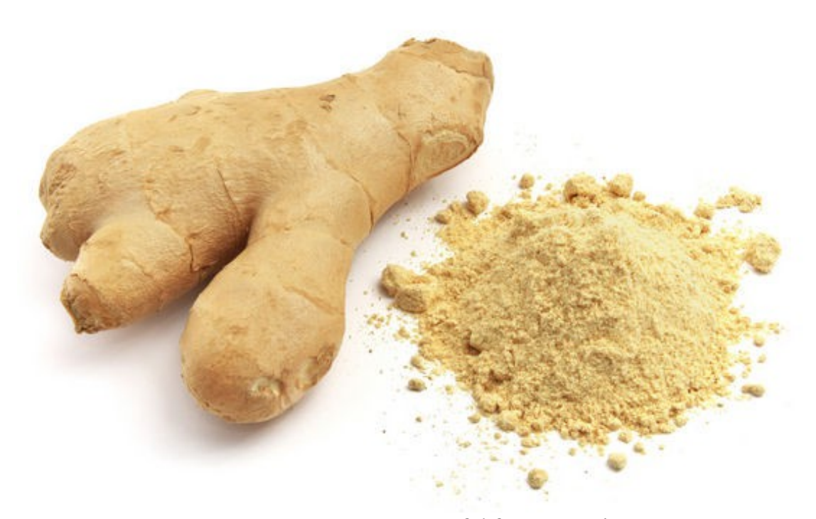
Ginger Root, a powerful fiery ingredient

Working with Hecate in intuition or other means, you will be directed as to the type and number of oils to use with certainty. A various combination of hot, cold etc oils will be necessary to create the necessary elements for your blade.