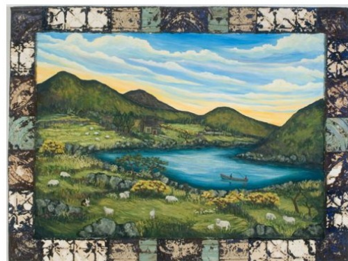
Catch of the Day Mixed Media 48x36