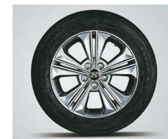
R17 Diamond-cut Alloys