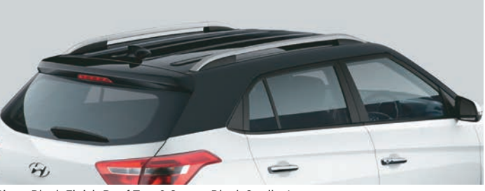
Piano Black Finish Roof Top & Sporty Black Spoiler*