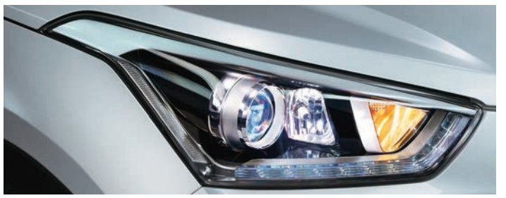
Bi-functional Projector Headlamps with LED Positioning Lamps