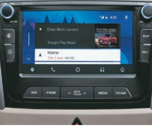
Android Auto Connectivity