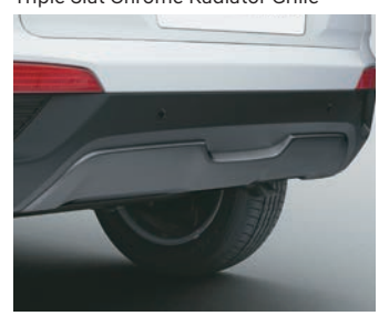
Sporty Front and Rear Skid Plates