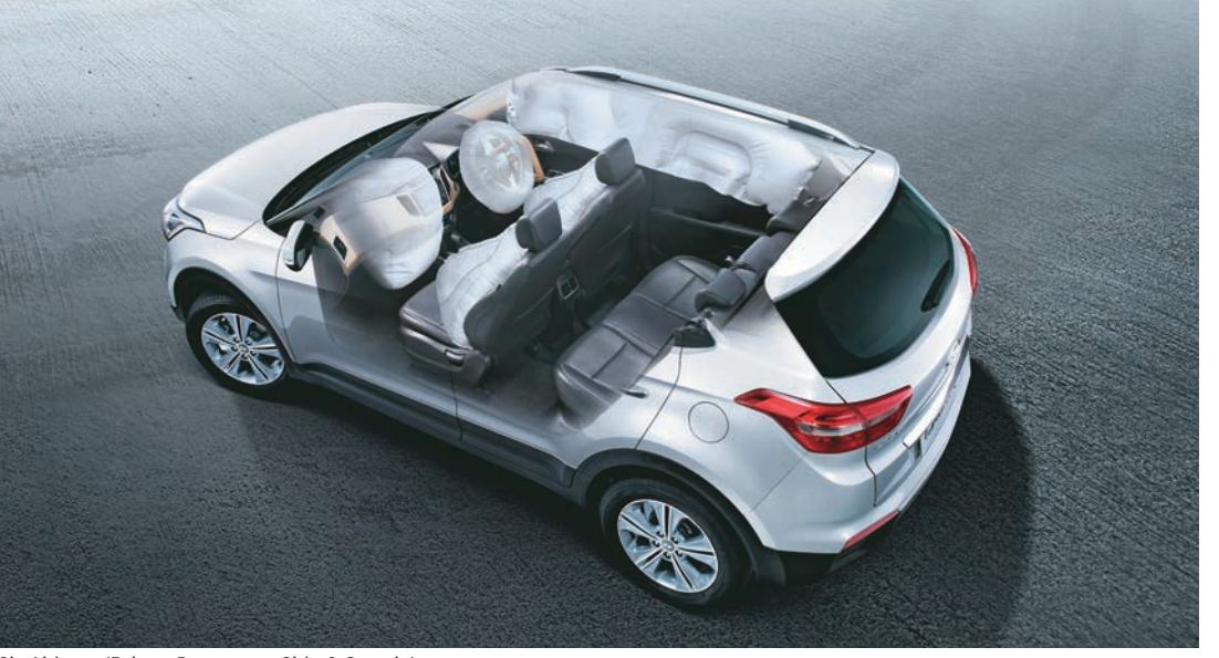
Six Airbags (Driver, Passenger, Side & Curtain)