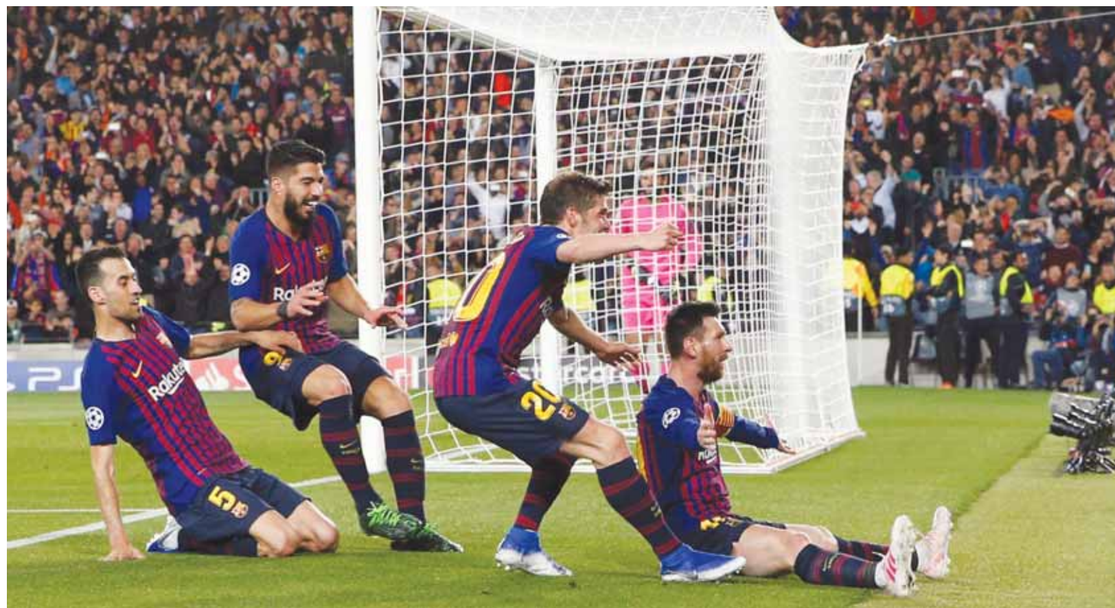
Barcelona's Lionel Messi (right) celebrates after scoring against Liverpool in the Champions League semi-final first leg in Barcelona on Wednesday night.

The comeback will be even tougher for them given Barcelona, with La Liga wrapped up, will surely rest a host of players against Celta Vigo this weekend while Liverpool, a point behind Premier League leaders Manchester City, will have to be at full throttle again away at Newcastle tomorrow. "They can still