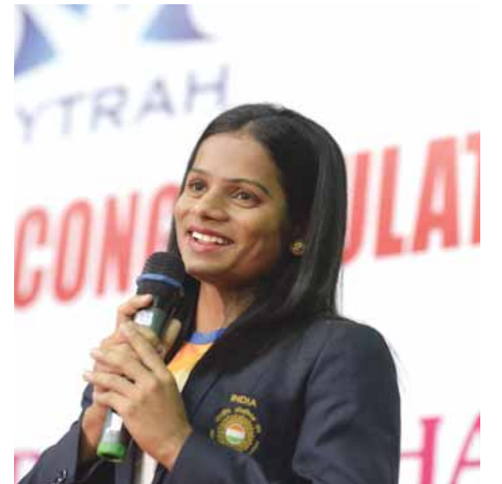
File photo of Indian sprinter Dutee Chand.

Semenya, who won the 800m Olympic title in 2012 and 2016, vowed to "once again rise above and continue to inspire young women and athletes in South Africa and around the world".