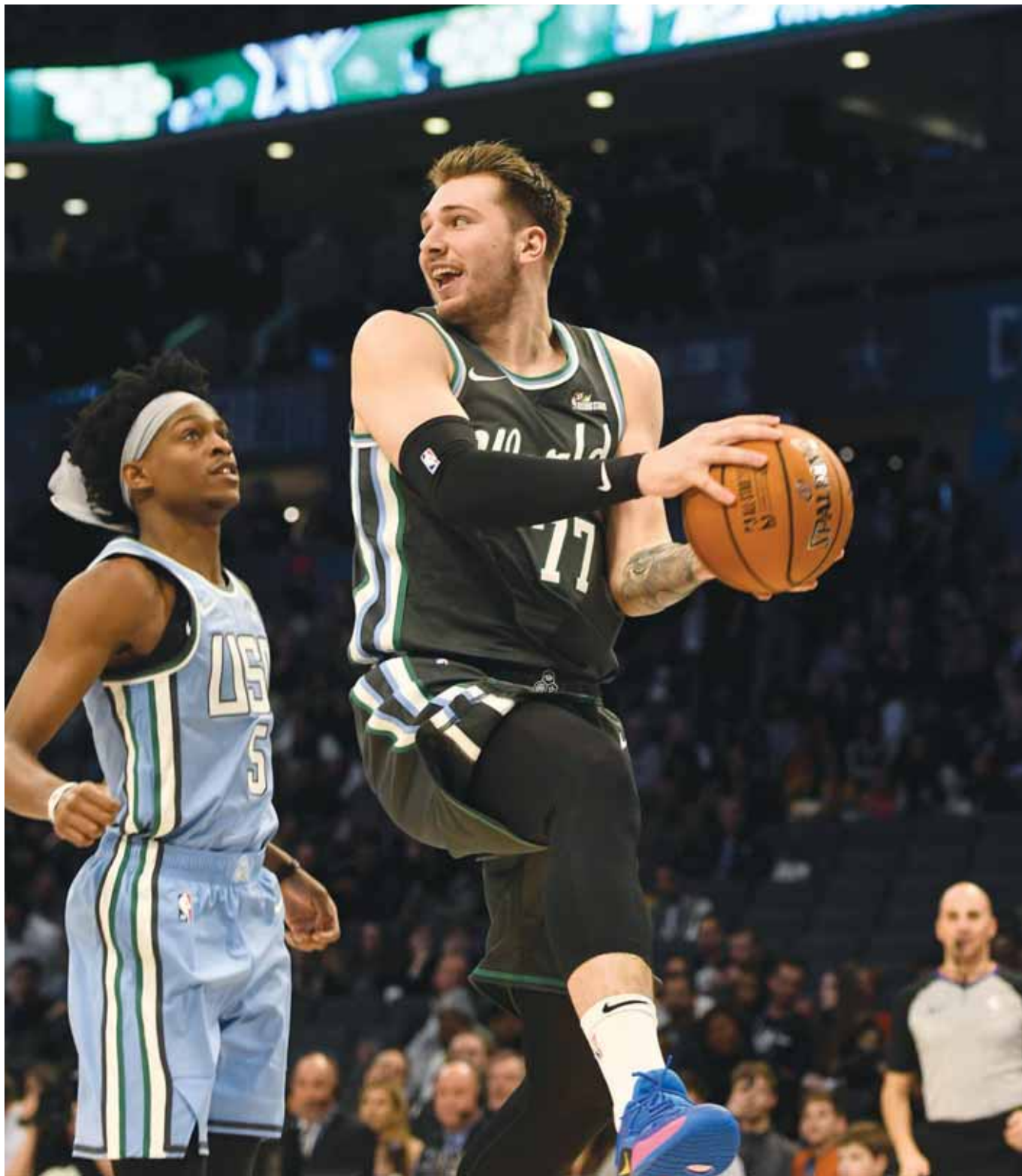
Luka Doncic of the Dallas Mavericks drives past the US Team's Aaron Fox, of the Sacramento Kings, during the MTN Dew Ice Rising Stars game at Spectrum Center in Charlotte on February 15, 2019.

While the Heat gave up two picks to acquire Dragic from the Phoenix Suns in February 2015, including their unprotected 2021 selection, they generally have