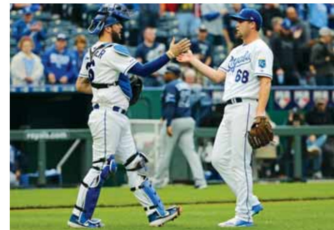
Kansas City Royals catcher Cam Gallagher (left) celebrates with relief pitcher Jake Newberry after defeating the Tampa Bay Rays in the second game of a doubleheader.

The Orioles opened the scoring on a Smith RBI single in the first inning, but the White Sox answered with a run-scoring single from Engel in the second.