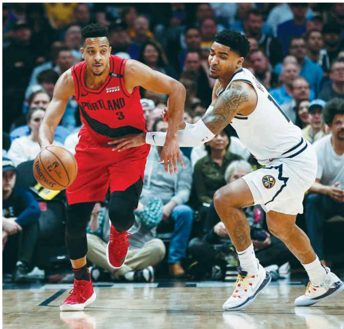
Portland Trail Blazers guard CJ McCollum (left) dribbles the ball up court against Denver Nuggets guard Gary Harris in the first quarter in game two of the second round of the 2019 NBA Playoffs at the Pepsi Center.

Game three in the series takes place in Portland on Friday. Nuggets coach Mike Malone