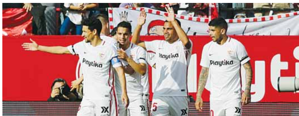
Sevilla host Leganes today hoping to make up for their shock 1-0 defeat at Girona.