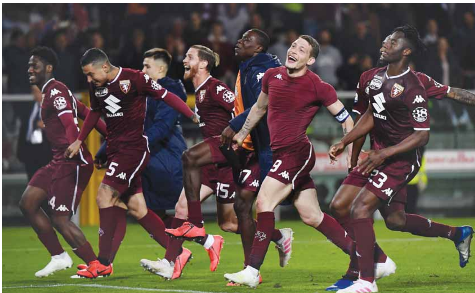
Torino's players celebrate after their first win over AC Milan since 2001 in the Italian Serie A at the Grande Torino Stadium in Turin last week.

Torino captain Andrea Belotti is back to his goalscoring best, with six goals in eight games and 13 for the season, in-