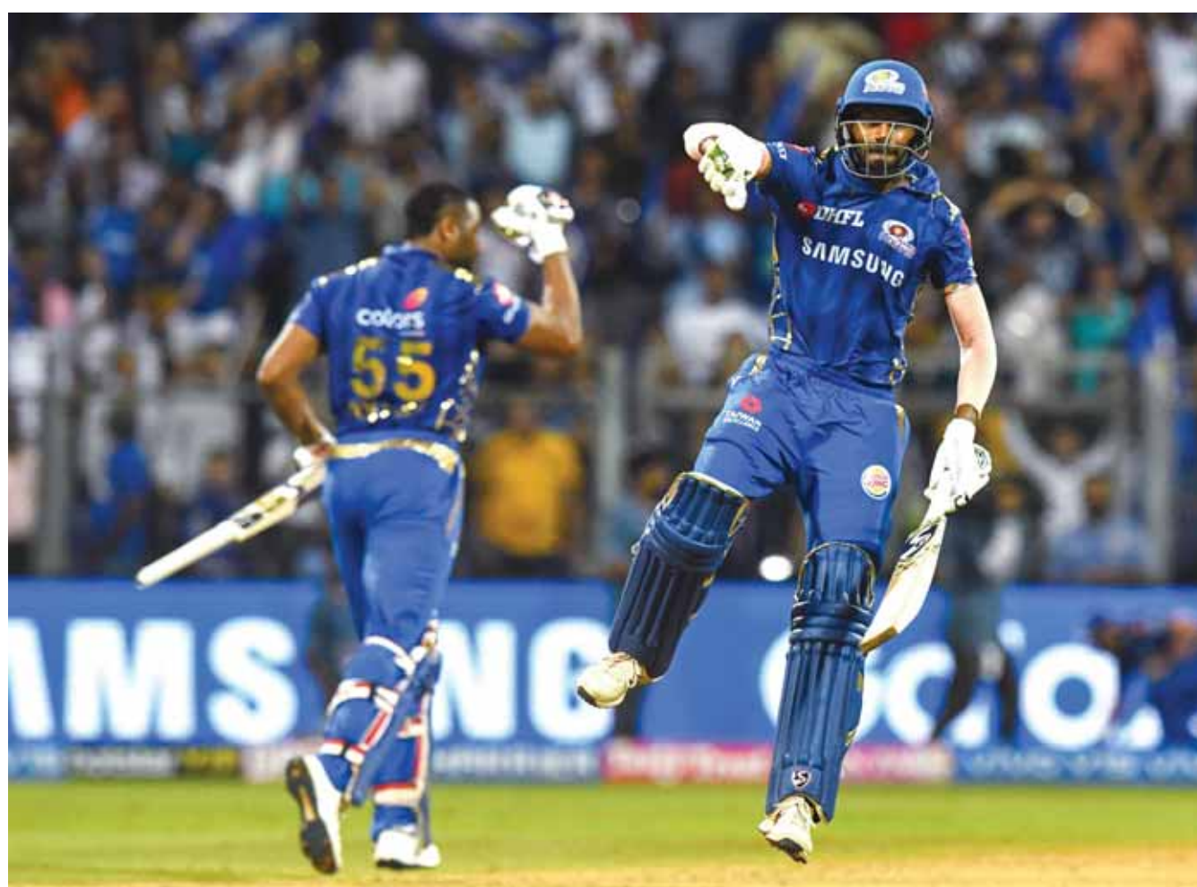
Mumbai Indians' Hardik Pandya (right) and Kieron Pollard celebrate after winning the 2019 Indian Premier League match against Sunrisers Hyderabad at the Wankhede Stadium in Mumbai yesterday.