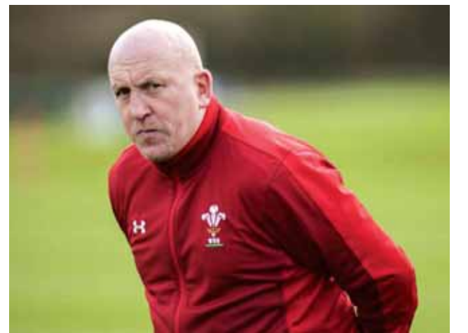
Wales defence coach Shaun Edwards.

"Shaun has decided not to take that contract, which we must respect and we wish Shaun the best in what lies ahead for him post Wales."