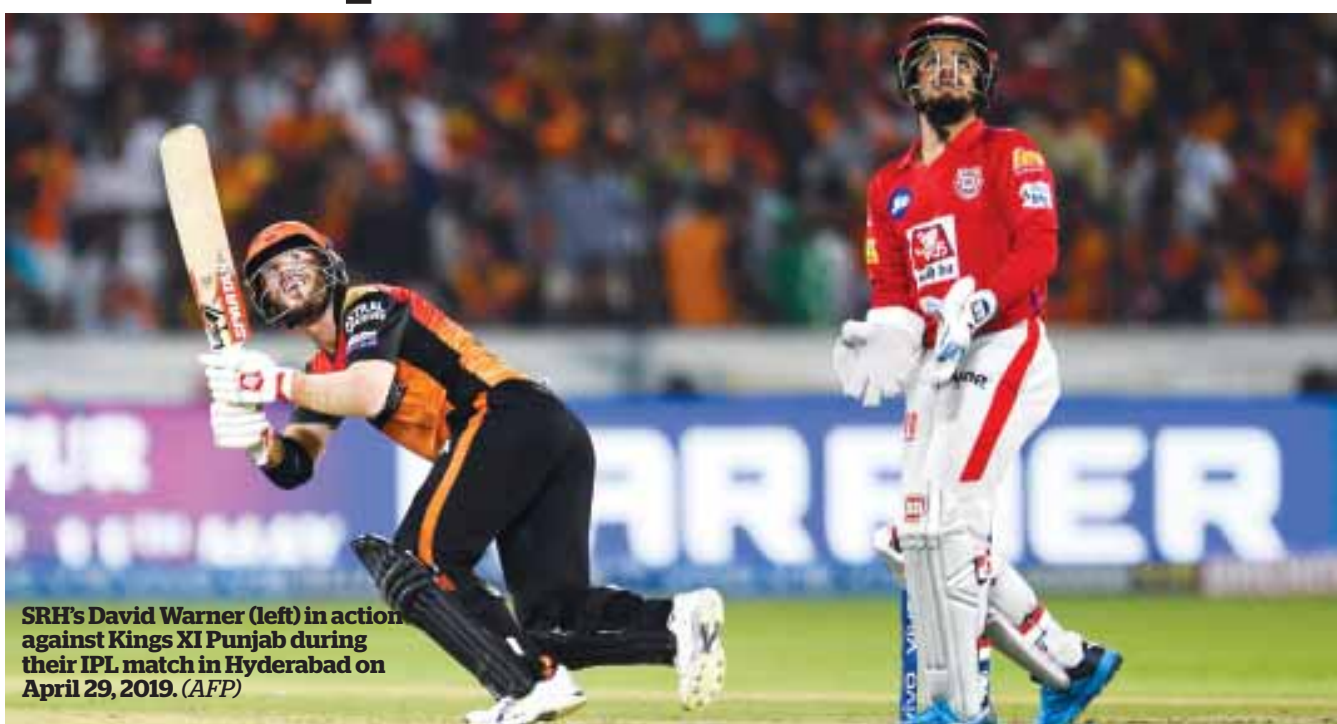
SRH's David Warner (left) in action against Kings XI Punjab during their IPL match in Hyderabad on April 29, 2019.

"I'm still very grateful for the opportunity... I'm OK with that because I gave it everything I could."