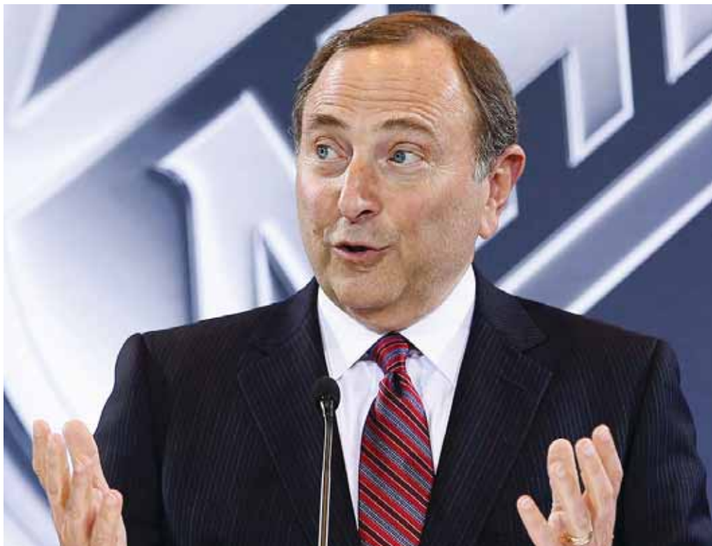
NHL commissioner Gary Bettman.