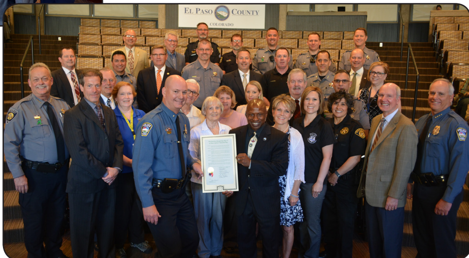
The Board of El Paso County Commissioners recognize the dedication of the Peace Officers Memorial in May of 2018, honoring officers killed in the line of duty in El Paso and Teller Counties since 1895.