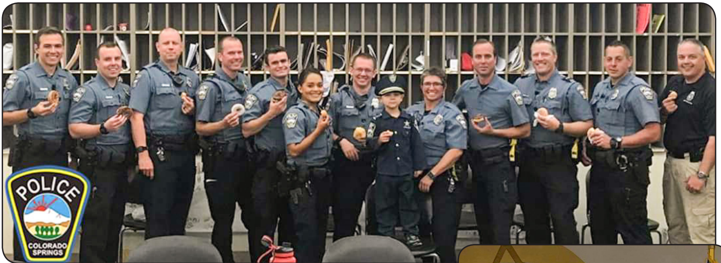
Colorado Springs Police comically enjoy delicious donuts.

Please visit the Criminal Justice Coordinating Council website at https://communityservices.elpasoco.com/community-outreach-division/justice-services/criminal-justice-coordinating-council