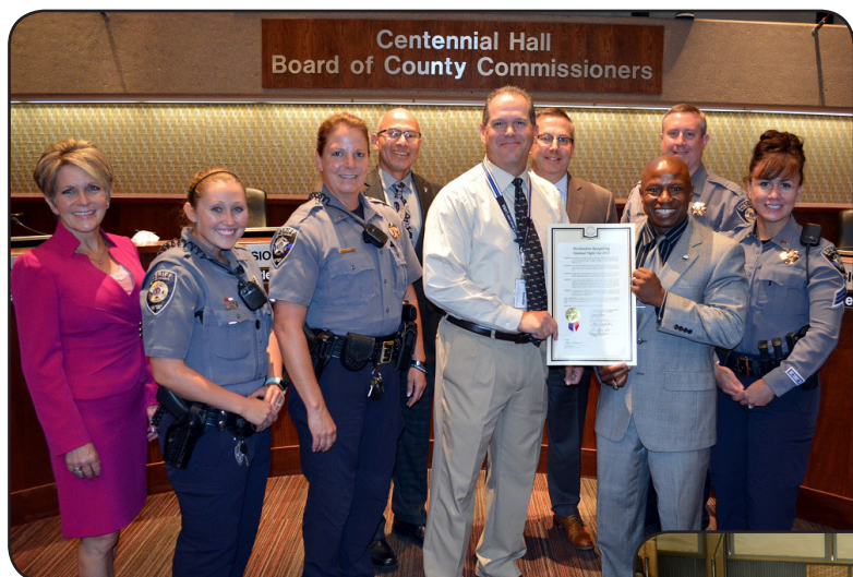
The Board of El Paso County Commissioners recognize the 35th annual National Night Out held in August of 2018. National Night Out is a positive, proactive opportunity for El Paso County to join forces with thousands of other communities across the country in promoting cooperative police-community crime prevention efforts.