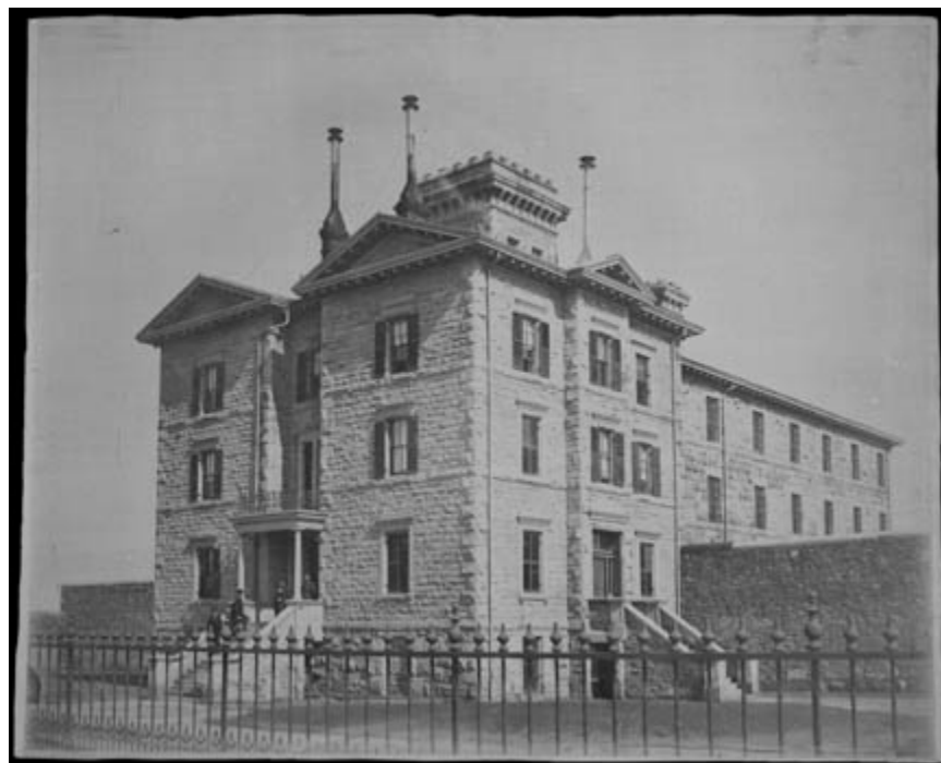
City and County Jail, Hamilton, circa 1890 RG 15-90-0-0-47 Public buildings – oversized photographs