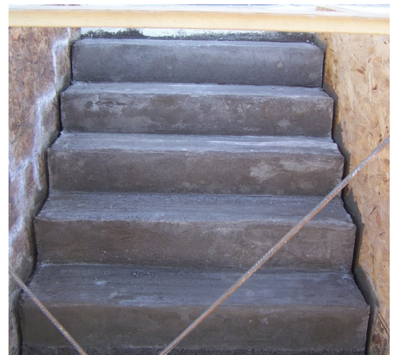
New steps to the service building.