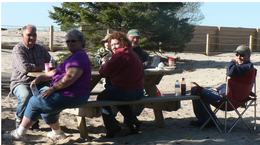
Relaxing and enjoying the peace and quiet.