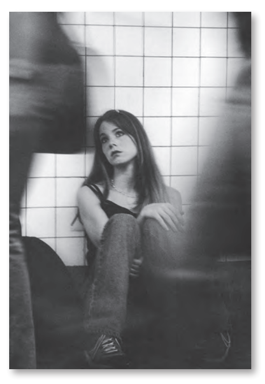
▲ Photo 6.3 Girls who run away from home often find themselves on the streets where they are preyed upon and often forced into prostitution, shoplifting, and drug trafficking.

Others wonder why a special feminist theory is needed, since most female offenders tend to be found in the same places as their male counterparts—i.e., among single-parent families located in poor, socially disorganized neighborhoods. Male and female crime rates increase or decrease together across different