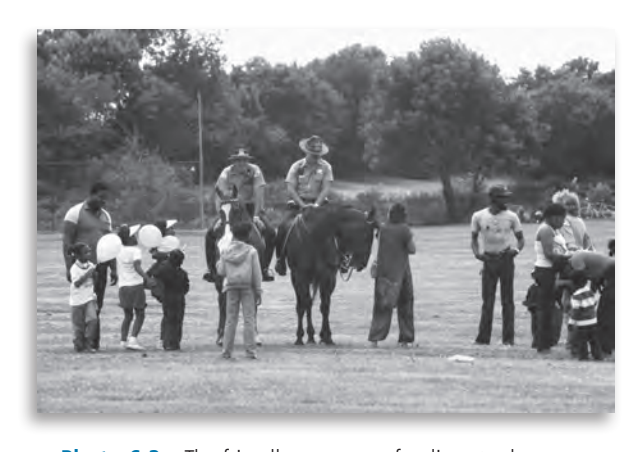
▲ Photo 6.2 The friendly presence of police at a large ethnic festival demonstrates the peacekeeping approach to crime prevention.

Peacemaking criminology is a fairly recent addition to the growing number of theories in criminology and has drawn a number of former Marxists into its fold. It is situated squarely in the postmodernist