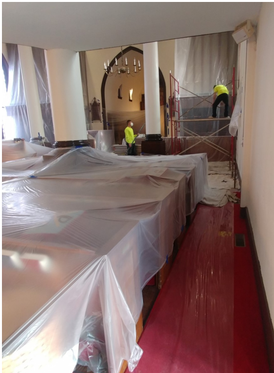
Plaster work continues in the nave while we are participating in online worship at home.