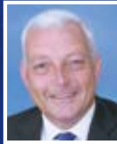
Carlos A. Gimenez Mayor, Miami-Dade County

The Cruise Capital of the World is growing at full speed. I'm proud to see an increasing number of our cruise partners expanding their presence at PortMiami. It is a signal of their confidence and trust in our thriving community.