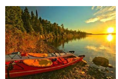
Isle Royale National Park

Grand Portage, your last stop in Minnesota, is 2 ½ hours northeast of Duluth and offers much to do. The Grand Portage National Monument features the meticulously restored North West Company Depot and Heritage Center where you can learn the rich history of aboriginal culture and the fur trade. Grand Portage State Park has exhibits showcasing life of the area's Chippewa Indians. From Grand Portage, you can enjoy a boat ride to Isle Royale National Park, an International Biosphere Reserve. Isle Royale is one of the least visited National Parks—its scenery is breathtaking. View ancient lava flows, historic lighthouses, shipwrecks, abandoned copper mining sites, and wildlife galore!