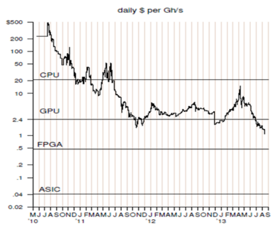
Fig. 1. Revenue per GH/s vs. Energy costs [8]

goes below these costs the profits will turn negative and rig should turn off.