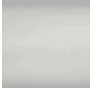
Gray - DSSRI034