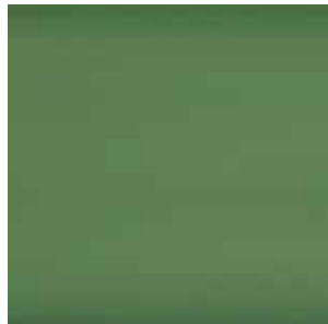
Green - DSSRI033