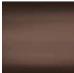
Chocolate - DSSRI036