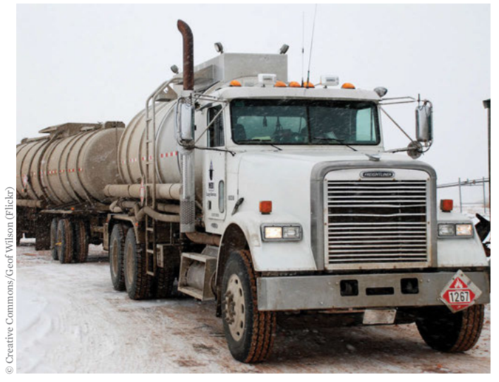
Increased truck traffic from oil and gas operations can damage local roadways. Many communities have negotiated road maintenance agreements that require operators to cover the costs of roadway maintenance.

Unconventional oil and gas development can move fast. Thus, local governments may need to respond quickly with the