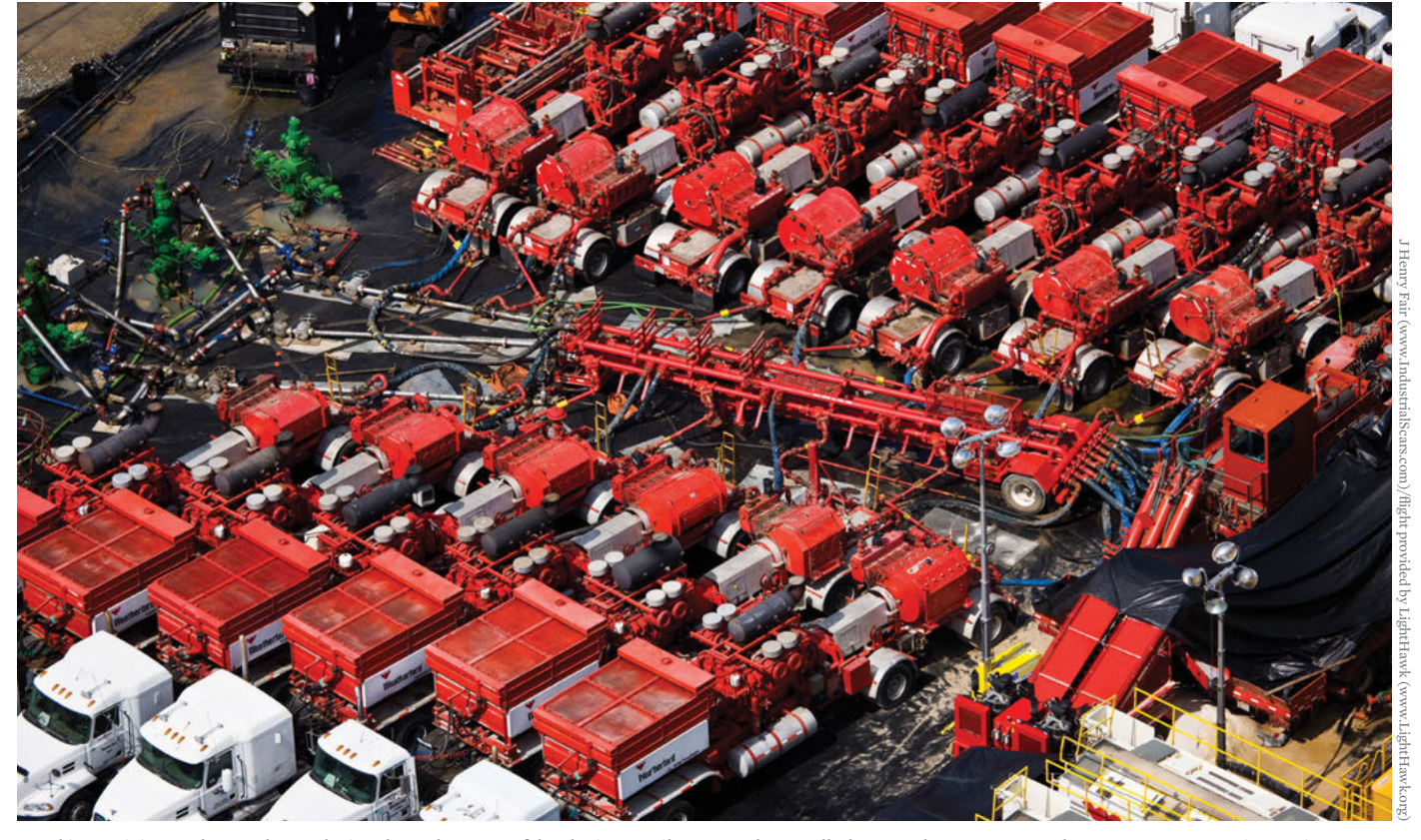
Trucking activity can be very heavy during the early stages of developing an oil or natural gas well; these trucks most commonly transport construction equipment and materials; water, sand, and chemicals for hydraulic fracturing; and wastes. This photo shows trucks used to inject water underground at high pressure during hydraulic fracturing.

physical landscape and degrade attractiveness of the local scenery. Many jurisdictions include specific language encouraging or discouraging certain practices and outcomes, such as visual screening, the placement of equipment, and operating in ways that minimize landscape impacts.