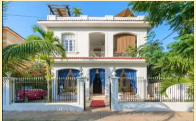
El Candil Boutique Hotel

The hotels we use In the Trinidad/Cienfuegos area do not compare to those in Havana. The exact hotel will be confirmed closer to departure but previous trips that we have operated recently include smaller 3-star properties providing simple accommodations with private bathrooms, hot and cold water, air-conditioning and mini-bars. While the accommodations in the Trinidad area are more rustic, we believe experiencing rural Cuba and Trinidad is well worth the visit, and with some flexibility you will come away with a much richer Cuban experience.