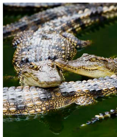
Photos: Cuban Tody, Topes de Collantes National Park, Sculpture with Model, Cuban Crocodile