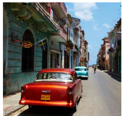
Photos: El Morro Fortress, El Yunque (the Anvil), Cuban Land Snail, Vintage Cars in Havana