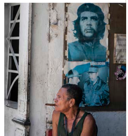
Photos: Vintage car outside El Temple , Hemingway's Typewriter, Havana Steet Scene