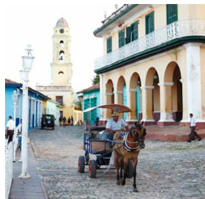
Photos: Cuban Trogon or Toco-ro-ro, Tobacco Harvest, Roseate Spoonbill, Trinidad