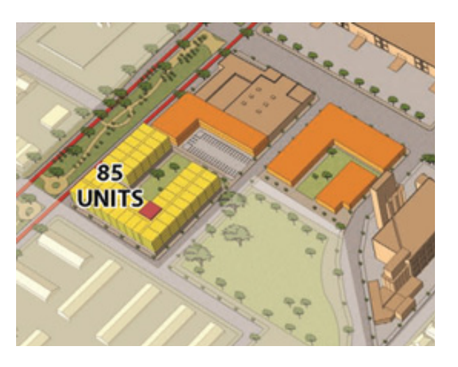
1600-14 Campbell Street, Oakland Warehouse Company – GE Mazda Lamp Works