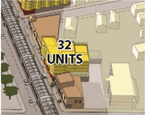
Three adjoining Local Register properties on the 1600 block of 7th Street, which comprise the remaining historic 7th Street commercial area

Continued use of the two remaining historic structures at each end of this block and medium-density infill residential development on the mid-block site of the former Lincoln Theater.